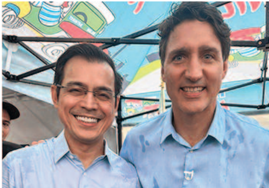
Former Manila Mayor Isko Moreno with Prime Minister Justin Trudeau at the festival.

"Canada Fiesta Extravaganza" events of the Philippine Extravaganza, Arts, Culture and Heritage (PEACH) under the leadership of Nestor Von