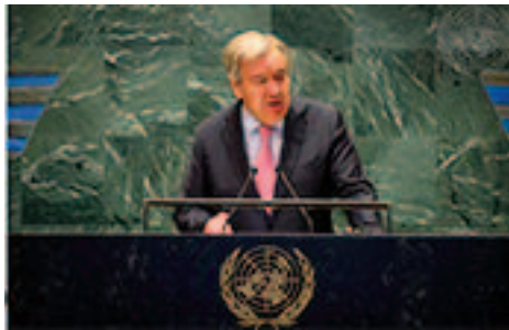
UN Secretary General Antonio Guterres delivering his speech

Following are UN Secretary-General António Guterres' remarks at the opening of the Summit of the Future, in New York today: Sept. 22, 2024: