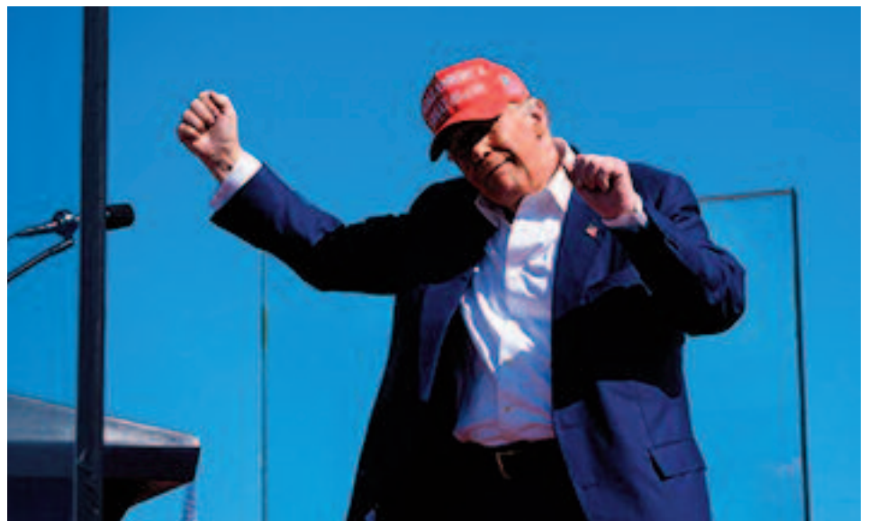
Trump at a campaign rally in North Carolina over the weekend Published 23 Sep 2024 - Republican election contender Donald Trump has said that he will not run again for the presidency of the United States if he loses election (Al Jazeera news)