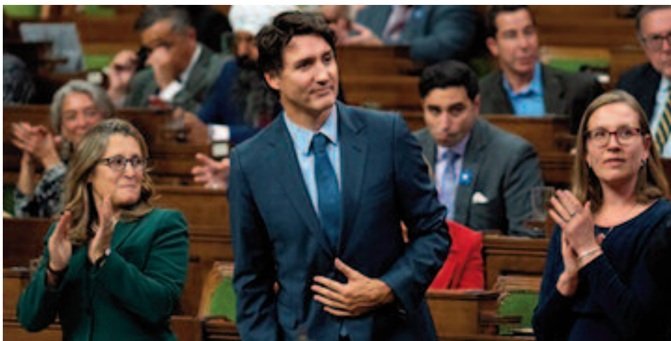
Prime Minister Trudeau rises to speak while the other Liberal Party members seem to applaud what is being said.

Canadian Prime Minister Justin Trudeau has survived a motion in parliament aimed at bringing down his government and triggering an election. Wednesday's no-confidence vote is the first in a series of similar votes expected to be put forward by the opposition Conservative Party amid Trudeau's