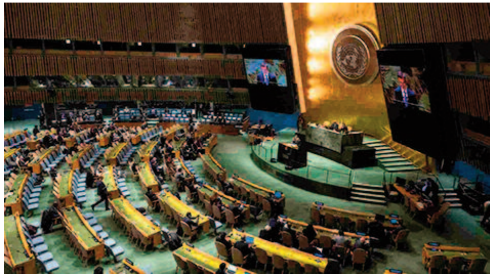
A view of the UN Summit of the Future, Sept. 22, 2024

and institutions are unable to respond effectively to today's political, economic, environmental and technological challenges. And tomorrow's will be even more difficult and even more dangerous.