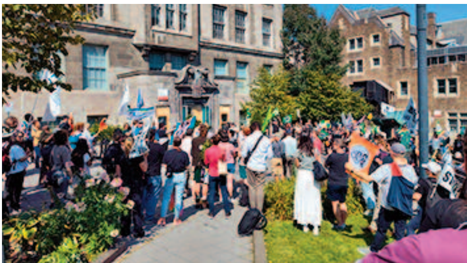
McGill law professors demonstration outside the James Administration building