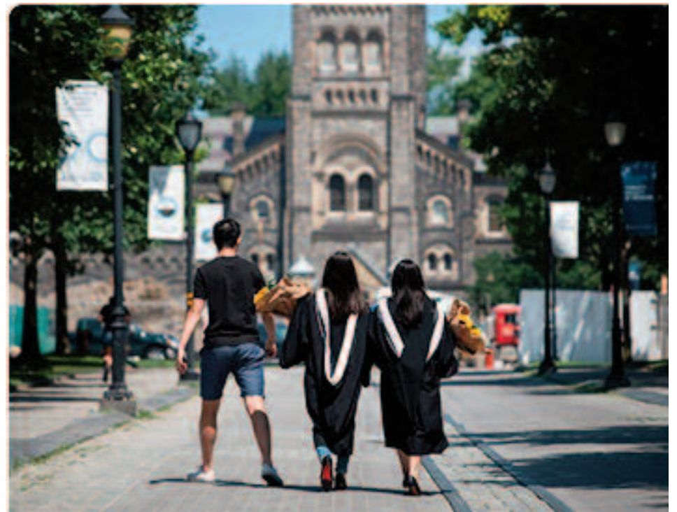
A generic photo of international students walking in a campus site anywhere in Canada