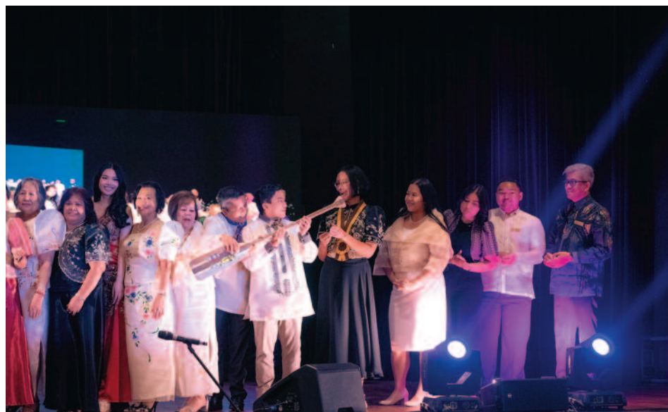
The passing of the GBA sagwan from the current city host Niagara Falls to the next city host Ottawa.