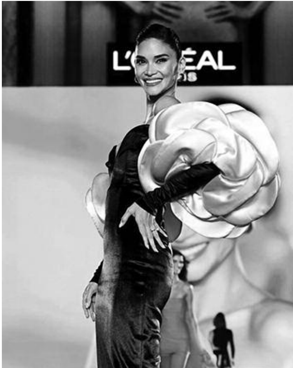
Pia Wurtzbach makes historic runway debut at Paris Fashion Week

Miss Universe 2015 Pia Wurtzbach-Jauncey made history as the first Filipina to grace the runway of French cosmetics brand L'Oréal at Paris Fashion Week.