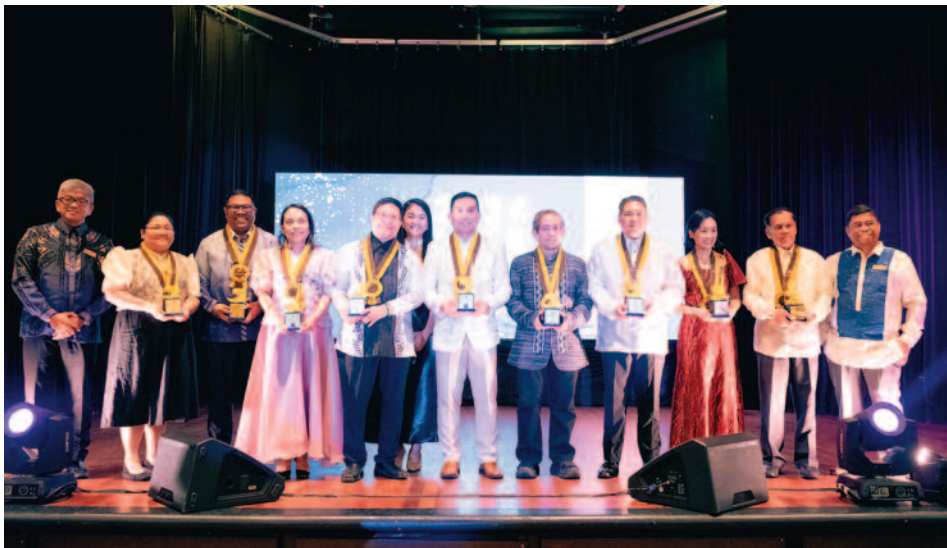
The 2024 Golden Balangay Awards winners