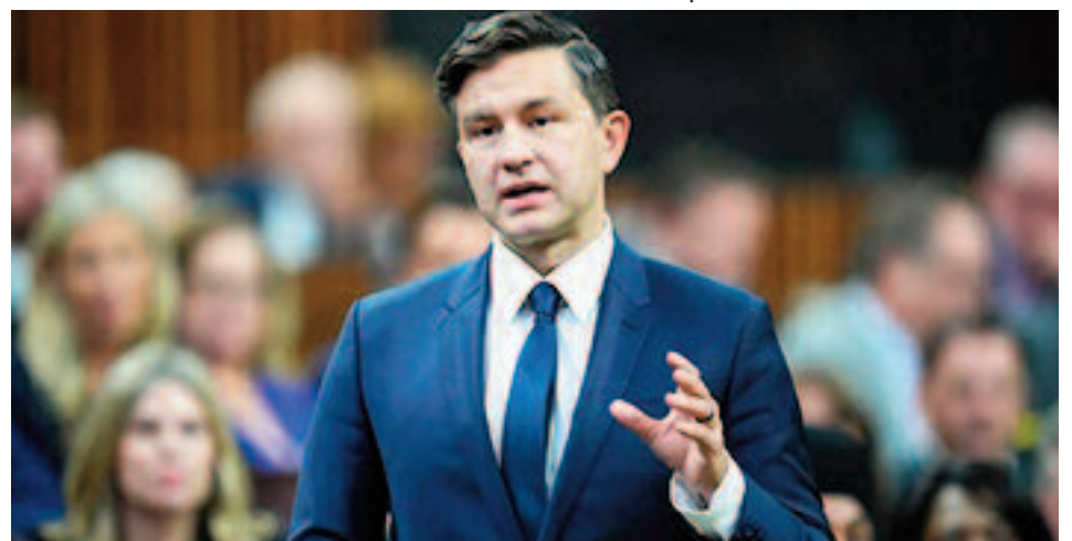
Conservative Party Leader Pierre Poilievre rises during question period on Parliament Hill in Ottawa, on Wednesday.

While this motion has failed, the Conservative party plans to bring at least two other similar no-confidence votes on