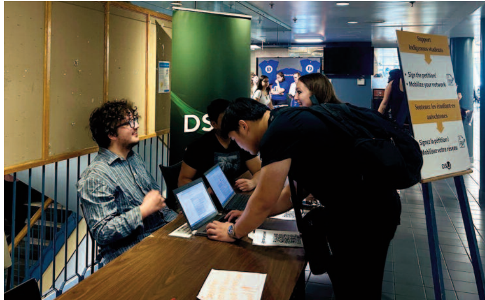
Students at Dawson College signing the "Indigenous student exemption from Law 14" petition

Many students have concerns about the law and their education, particularly those who have other languages as their mother tongue like immigrants, newcomers, international students, or those who struggle in the French language for a variety of reasons. The Indigenous community has expressed concerns because of the announcement and implementation of Law 14. There are around 300 Indigenous students enrolled in English CEGEPs. They are worried about the effect of the law in their education as they must be educated in the French language while their own mother tongue and culture are not given enough attention. The Quebec government explained that Indigenous students are exempted from Law 14, however, they must meet certain requirements. One of the requirements to be exempted from