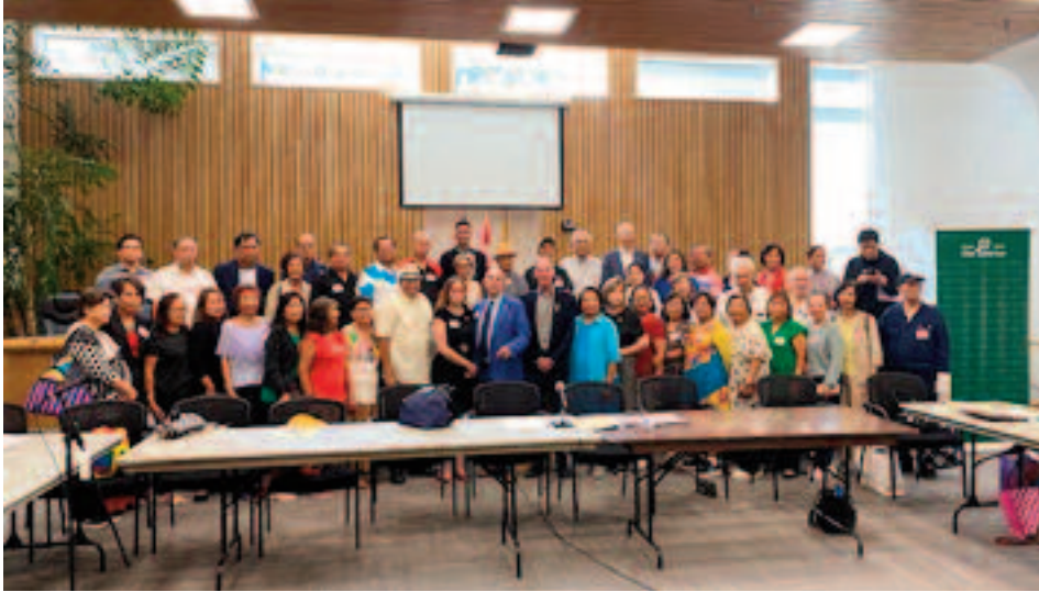
Photo shows some of the Filipino-Canadian community leaders who attended an exploratory meeting hosted by Côte-St-Luc Mayor Mitchell Brownstein at CSL City Hall on Cavendish Boulevard, Sept. 17, 2024

Manila, organized by Marvin Rotrand of United Against Hate Canada and Al Abdon of Filipino Heritage Society of Montreal, other mayors in Canada have expressed interest in having a twin city agreement for their own city. Mitchell Brownstein, Mayor of Côte-St-Luc invited all Filipino-Canadian community leaders on September 17,