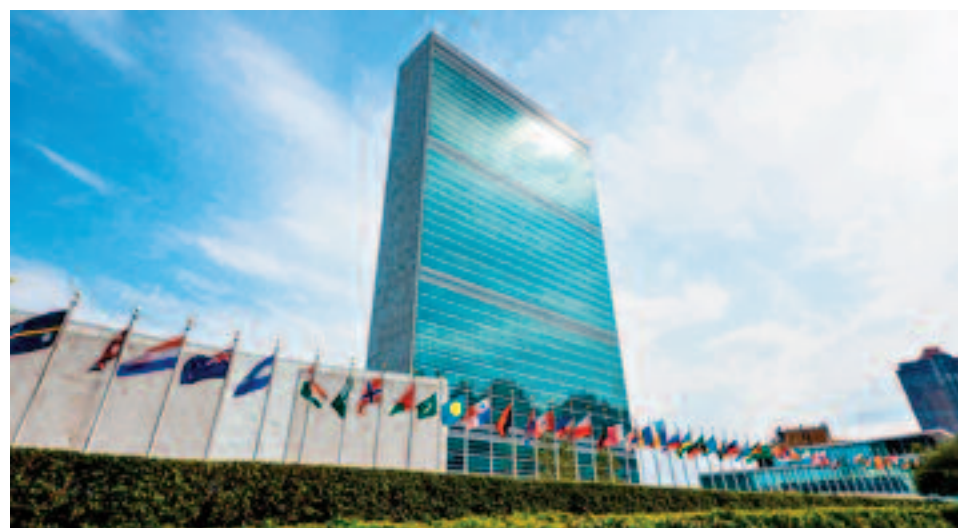
UN building in New York City

“inclusive and networked” multilateralism have been decidedly exclusive, as nongovernmental stakeholders have been barred from the negotiating room. Disputes have also arisen over some of the secretary-general’s institutional proposals, including one to appoint a UN Special Envoy for Future Generations and another to establish an emergency platform to manage “complex