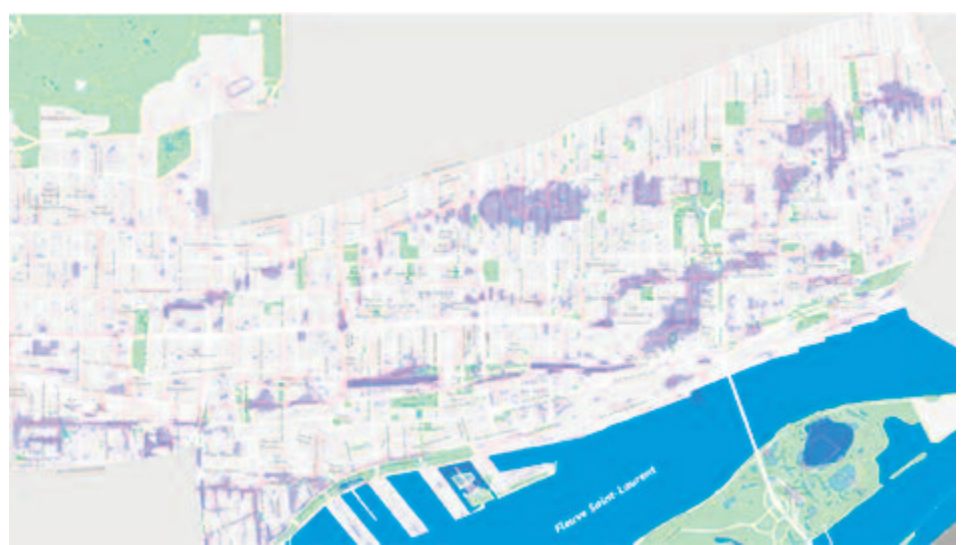
Map of Ville Marie