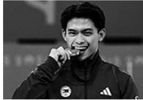
Gold medalist Carlos Yulo

Don't look now, but it looks like Carlos Yulo is out to conquer showbiz next.