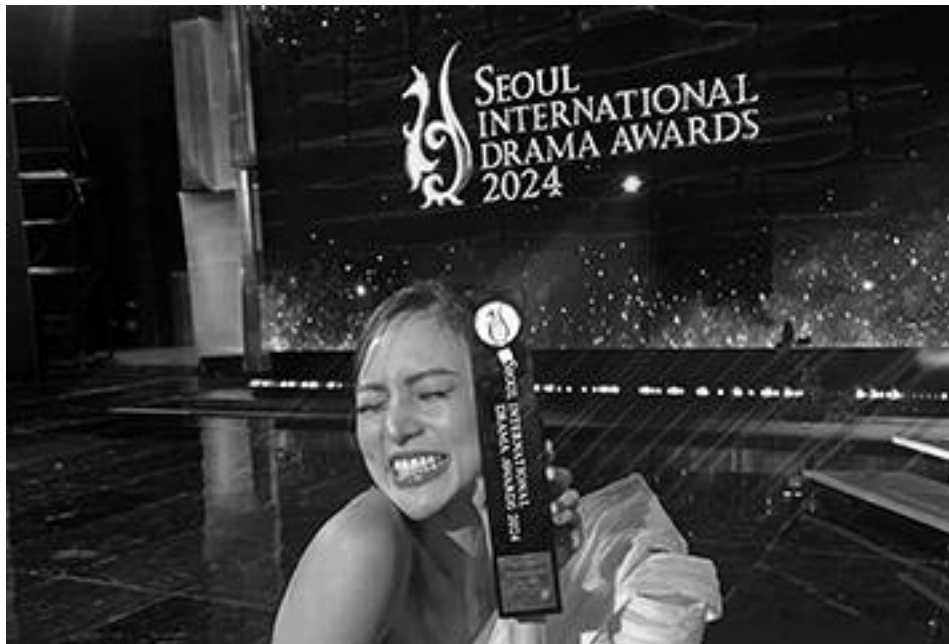
Kapamilya actress Kim Chiu at the 2024 Seoul International Drama Awards.

Kapamilya actress Kim Chiu wasn't able to hold back her tears while delivering her acceptance speech at the 2024 Seoul International Drama Awards.