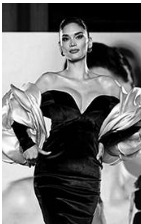
In March, Pia was named the face of L'Oréal Philippines' "Sayang? No, #ImWorthIt" campaign." ■

Celebrities like Viola Davis, Eva Longoria, Camila Cabello, Jane Fonda, and Simone Ashley also graced the runway.