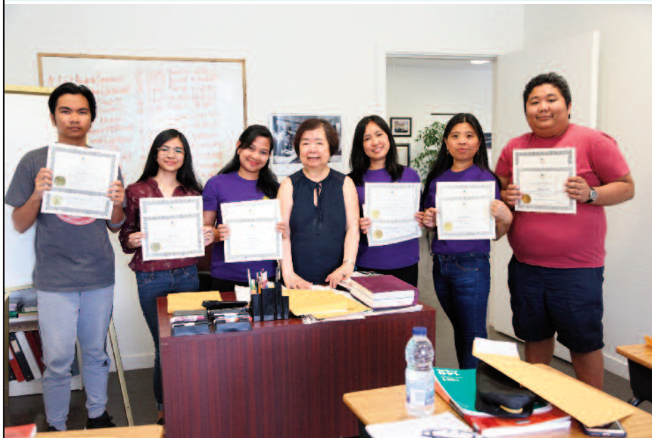
Presentation of Levels 1 and 2 proficiency certificates in French. Some of these students also completed Levels 3 and 4. All second language courses have six levels (Levels 5 and 6 are advanced levels). Writing courses offered after level 6.