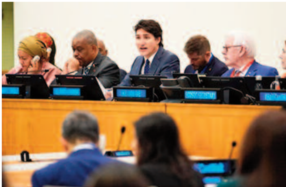
Prime Minister Justin Trudeau takes part in a meeting with an advisory group on Haiti at the United Nations headquarters on Monday.

The so-called zero draft of the pact, released in January, endorsed the goal of transitioning away from fossil fuels. But during recent negotiations that provision was unceremoniously deleted, thanks to opposition from oil and gas producers. Following public advocacy by a group of Nobel laureates, the latest revision includes the language agreed at COP28 in Dubai last December, reaffirming the call for parties to transition away from fossil fuels in a “just, orderly and equitable manner,” so as to achieve the goal of net zero global emissions by 2050. It also includes a reference to the loss and damage fund, intended to compensate nations injured by climate change; calls for the significant scaling up of adaptation financing; and commits signatories to a doubling of energy efficiency and tripling of renewable energy. While some backtracking seems possible, the ultimate