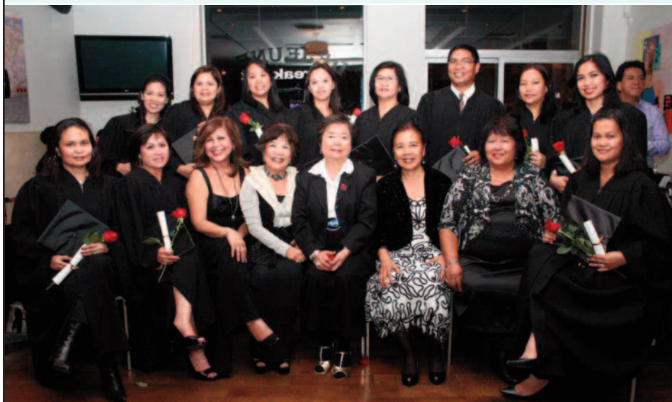
PAB graduates, batches 9 & 10, held at a downtown restaurant on Sherbrooke West, Montreal. Most of these graduates work in a prestigious nursing home in Montreal as well as long term care homes in Calgary, Alberta and Toronto, Ontario. Professional nurses teach the PAB program (non-credit, in-house designed courses).

7159, ch. de la Côte des Neiges (cor. Jean Talon W.) Montreal, Quebec H3R 2M2 Tel. 514-485-7861 E-mail: zbk@gilmorecollege.com