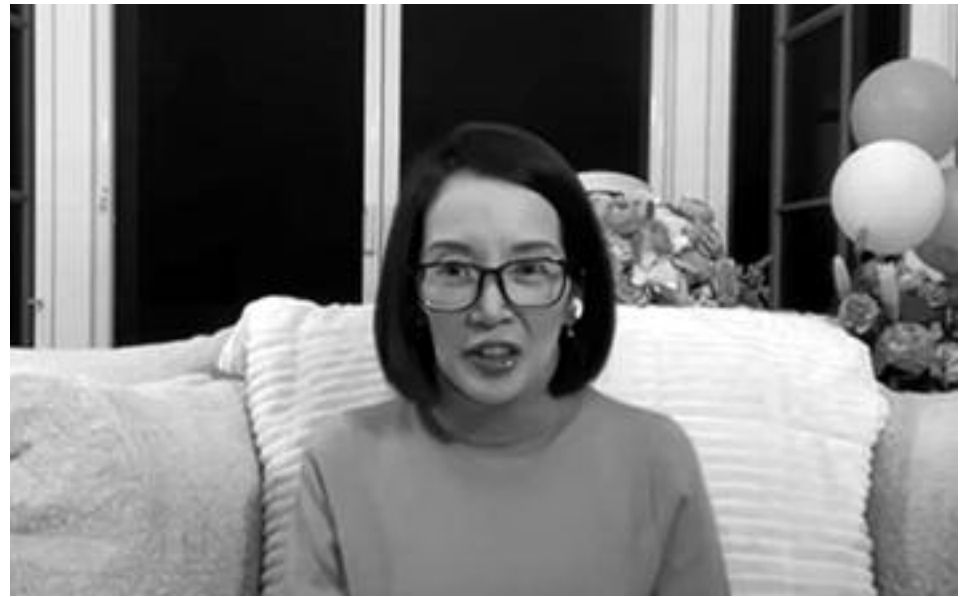
Kris Aquino (onFast Talk With Boy Abunda)

On Instagram on Sept. 12, Kris shared photos inside the plane with the caption, "See you, Manila"