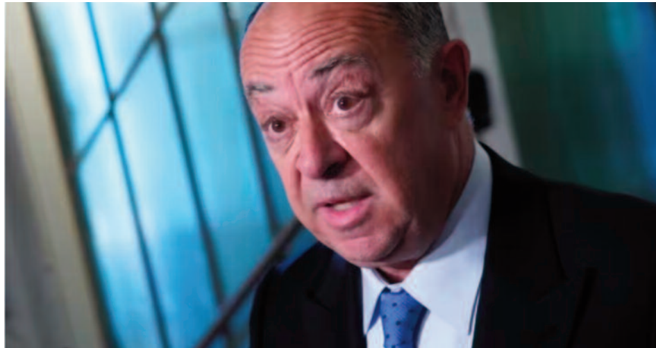
Health Minister Christian Dubé told reporters Quebec's fall COVID-19 vaccination campaign will kick off around Oct. 10.