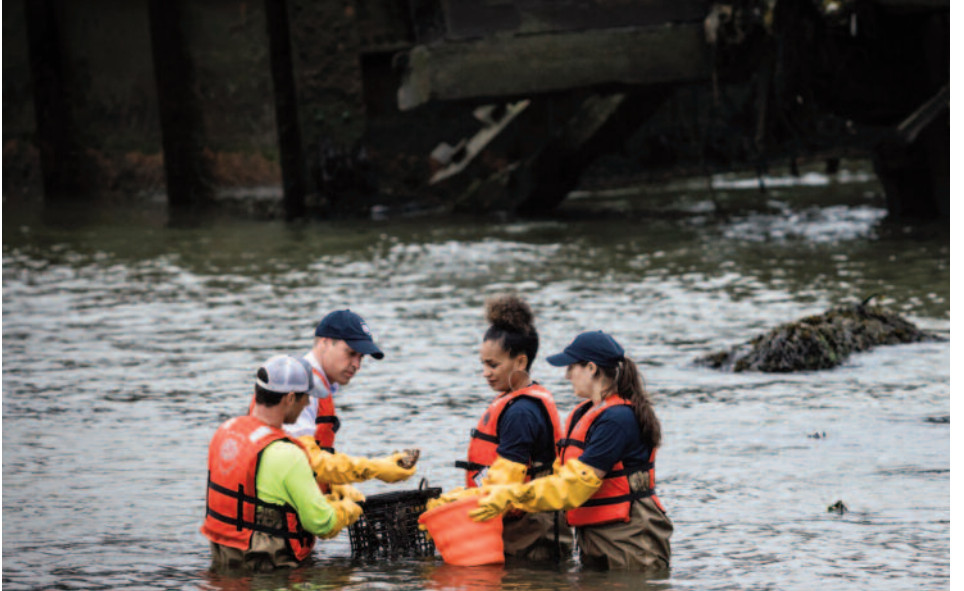
Prince William examines oyster samples in the East River with students from the Urban Assembly New York Harbor School in New York, on Monday, September 18, 2023 during a visit to an oyster reef restoration project.

The union representing screenwriters reached a tentative agreement with Hollywood studios to end a historic strike after nearly five months, raising hopes that a crippling shutdown of movie and television filming could be near an end.