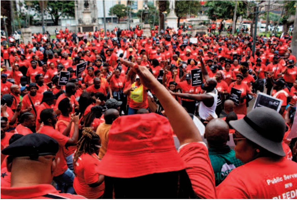
Public service unions want the government to improve on the 3% wage offer implemented for the 2023/24 year. They are demanding 10%.