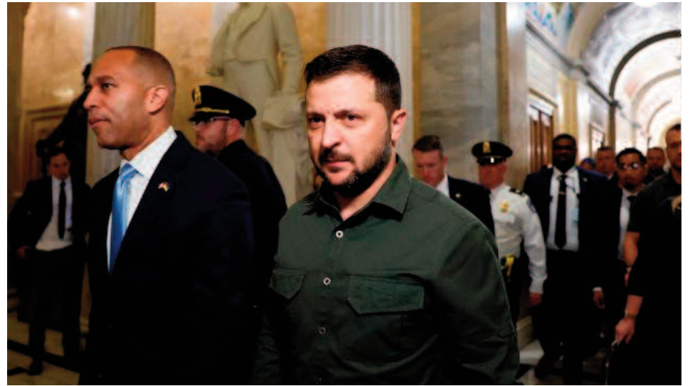
Ukrainian President Volodymyr Zelensky walks with House Minority Leader Hakeem Jeffries as he arrives for a meeting with lawmakers on Thursday.

"It found this momentum, this life of its own, and took off and became