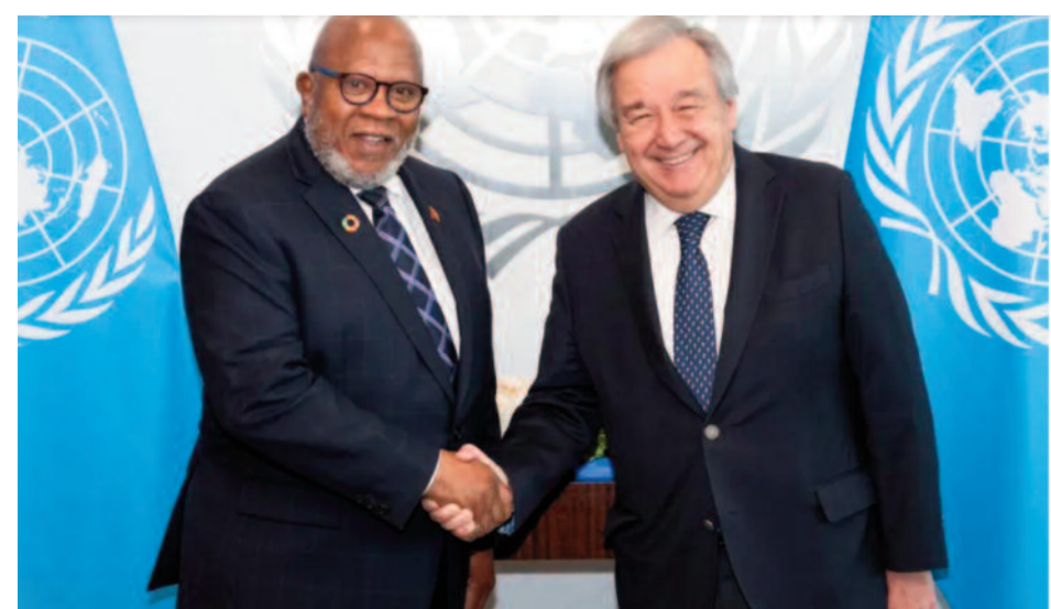
Secretary-General António Guterres (right) meets with Dennis Francis, President of the 78th session of the United Nations General Assembly. The General Debate of the United Nations General Assembly is the opportunity for Heads of State and Government to come together at the UN Headquarters and discuss world issues. The 2023 SDG Summit will take place on 18-19 September 2023 in New York. It will mark the beginning of a new phase of accelerated progress towards the Sustainable Development Goals with high-level political guidance