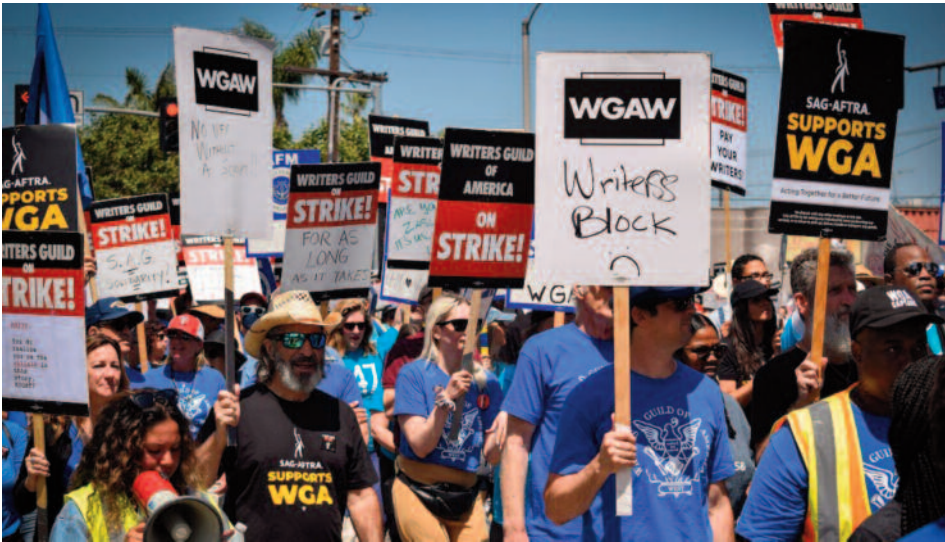
A tentative deal was reached, Sunday, Sept. 24, 2023, to end Hollywood's writers strike after nearly five months.

The union representing screenwriters reached a tentative agreement with Hollywood studios to end a historic strike after nearly five months, raising hopes that a crippling shutdown of movie and television filming could be near an end.