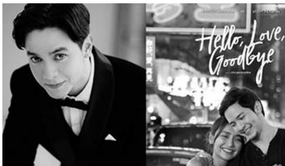
(From left) Alden Richards, Poster of "Hello, Love, Goodbye."

Even though it's been four years since the film "Hello, Love, Goodbye" hit theaters, Alden Richards said that he was dreading accepting new movie projects because of the record-breaking success of his movie with Kathryn Bernardo.