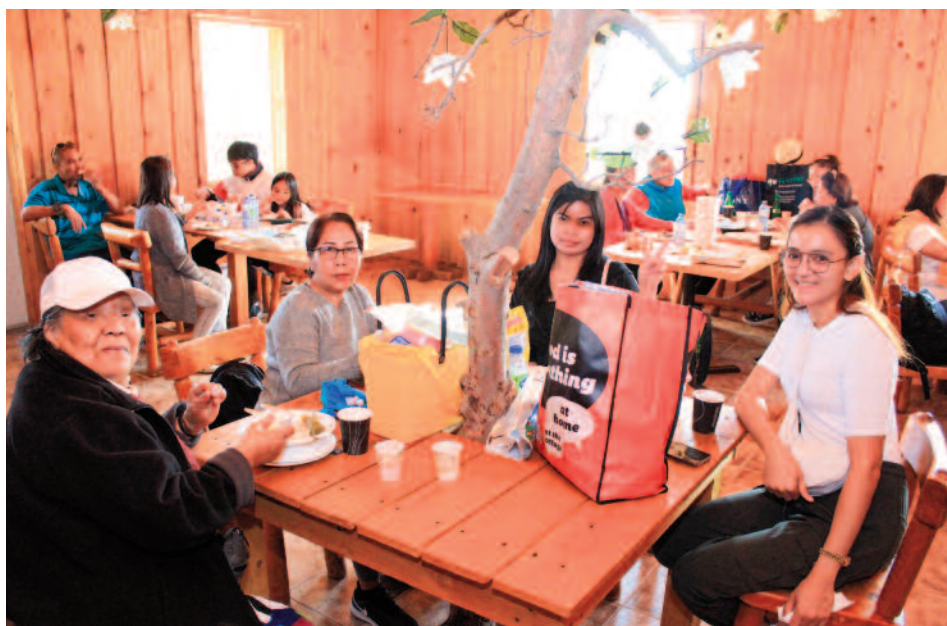
Sharing picnic food in our own private room reserved for Gilmore College International