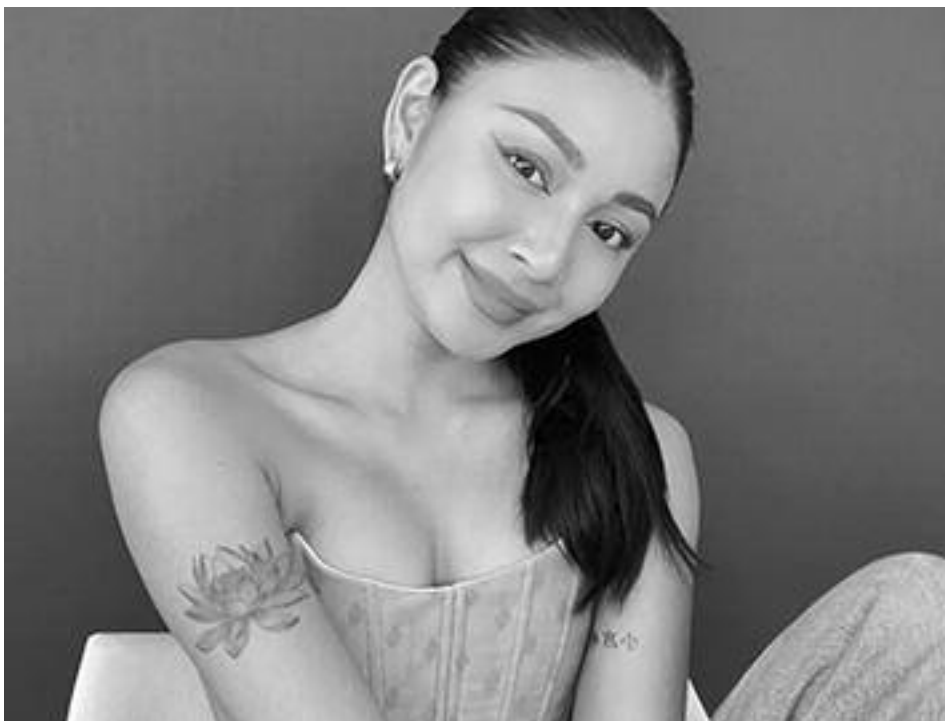
Nadine Lustre says showbiz 'beauty standards' should change

She said this experience taught her to just stop being a "yes man" when something does not sit well with her. "If it's something that's not really in line with your values and your vision, don't do it. And if your body tells you that you can't do it anymore, don't do it. Because your body knows best. And the thing is, you really have to put a boundary on the things that we do," Lustre said.