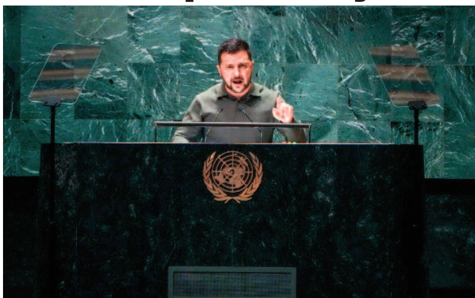
Ukraine's president, Volodymyr Zelensky, spoke before the Assembly on Tuesday in New York City.

His remarks were among the most scathing in a series of addresses by world leaders, including President Biden, who condemned Russia’s “naked aggression” and said the United States would continue to stand