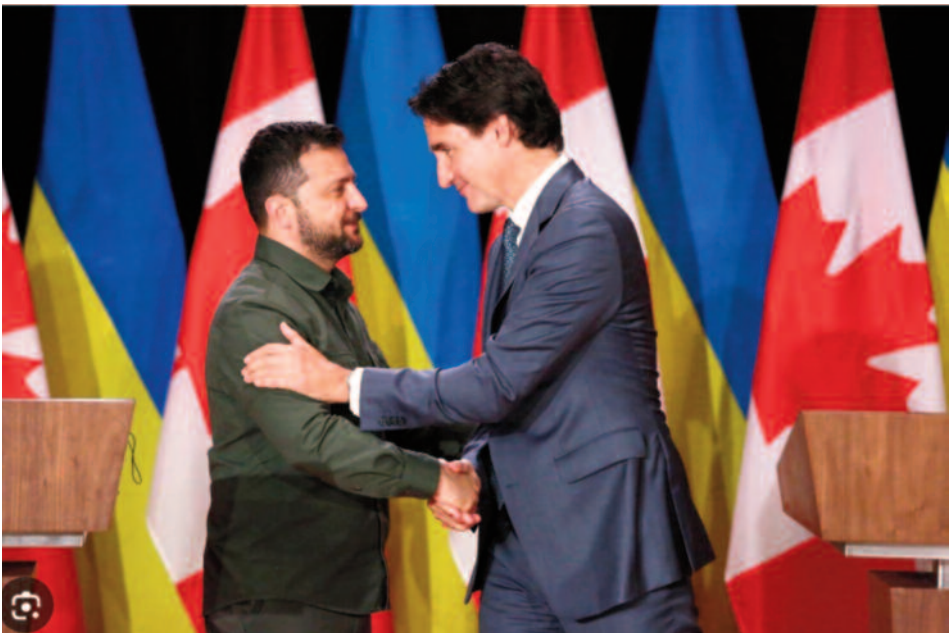
Canadian Prime Minister Justin Trudeau and Ukraine's President Volodymyr Zelensky shake hands at the end of a news conference on Parliament Hill on September 22, 2023 in Ottawa. history" in fighting previous wars and said it has helped saved thousands of lives in this war with aid. He also thanked Canadians for financial support and for making Ukrainians fleeing war feel at home in Canada.

(Sept. 22, 2023) Ukrainian President Volodymyr Zelensky has arrived in Canada on an unannounced visit to rally support for his country. Canadian TV showed Prime Minister Justin Trudeau meeting Mr Zelensky on the runway in Ottawa. It is Mr Zelensky's first trip to Canada since Russia's invasion in February 2022. Zelenskyy urged Canada on Friday to stay with his country to victory as he went to the Canadian Parliament seeking to bolster support from Western allies for Ukraine's war against the Russian invasion. Zelenskyy flew into Canada's capital late on Thursday after meetings with President Joe Biden and lawmakers in Washington. He spoke at the United Nations' annual meeting on Wednesday. "Moscow must lose once and for all. And it will lose," Zelenskyy said during his address in Parliament. Zelenskyy said Canada has always been on the "bright side of