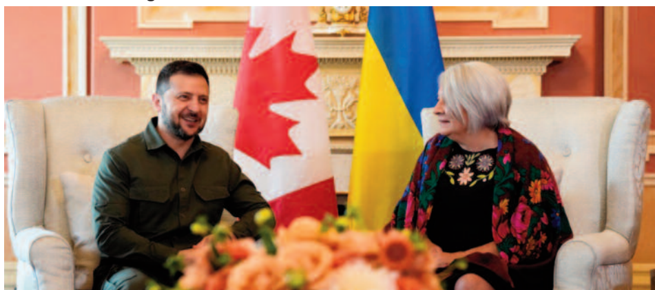
President of Ukraine Volodymyr Zelensky and First Lady Olena Zelenska met with Governor General of Canada Mary Simon at her residence in Ottawa.

Zelenskyy is facing questions in Washington about the flow of American dollars that for 19 months has helped keep his troops in the fight against Russian forces. A hard-right