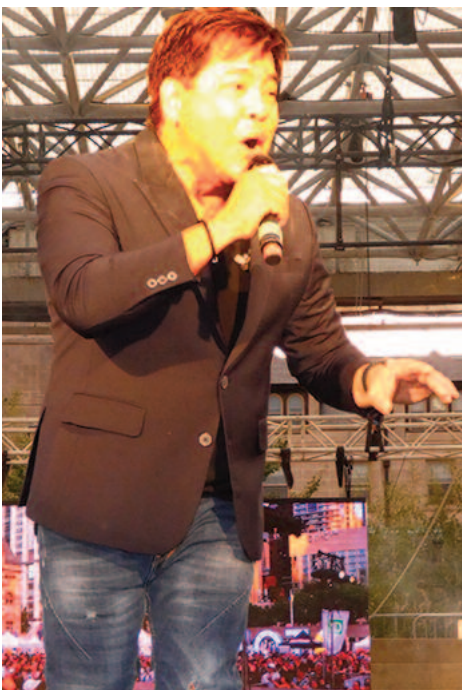
Martin Nievera, Filipino singer and actor.

The "Philippine Concert King" did it again! To the great amazement and full enjoyment of countless fans, Martin Nievera, a popular Filipino singer, actor, and performer entertained beautifully the adoring crowds during his open-air concert held on August 26, 2023, at the centre stage of Nathan Phillips Square, City Hall Grounds, Toronto, Ontario.