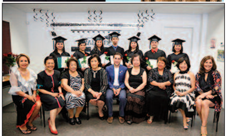
PAB Batch 12 Graduation