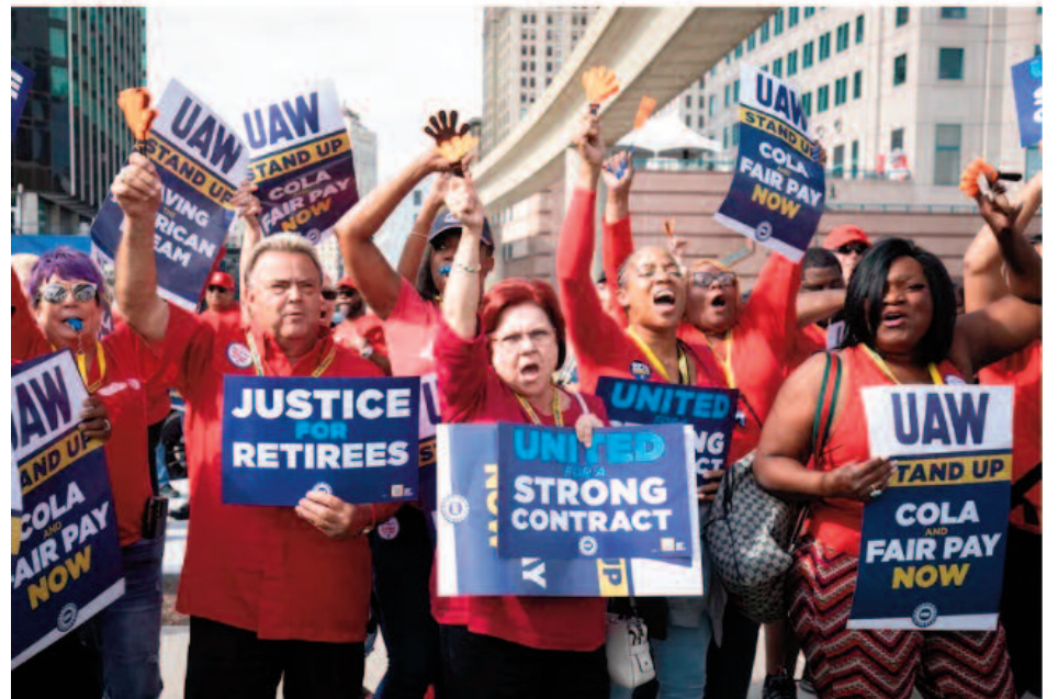
United Auto Workers members walk a picket line during a strike at the Ford Motor Company Michigan Assembly Plant in Wayne, Mich., Friday, Sept. 15, 2023.