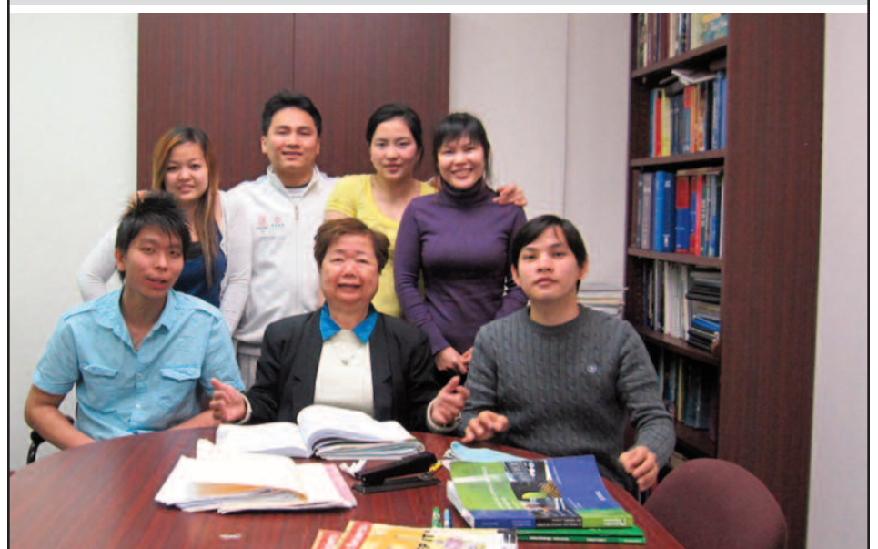
English and French Students