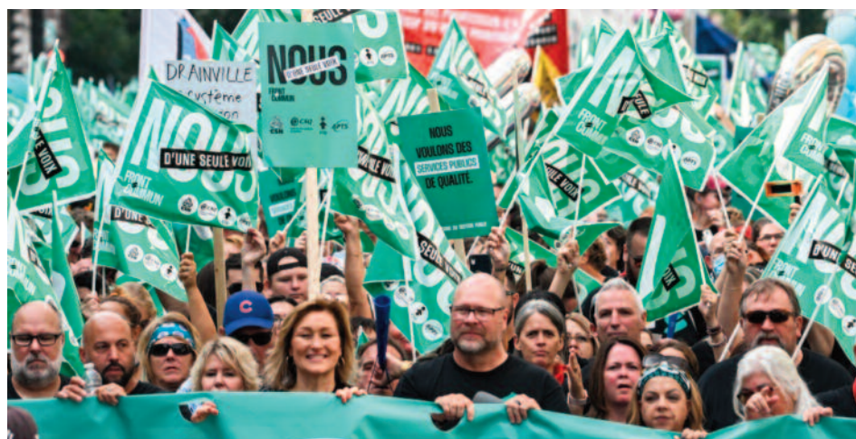
People take part in a public sector union demonstration in Montreal, Saturday, September 23, 2023.

About 420,000 public-sector workers make up the common-front. They primarily work in health, social