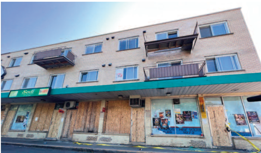
Firefighters found the man's body in the rubble in the building's basement. The building is located on Pascal Street near the Rolland Street intersection in Montreal North. (Sept. 23, 2023)