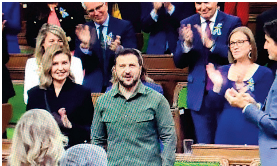
Stamdomg onvation for President Volodymyr Zelensky from the members of the Canadian Parliament.

Trudeau said Canada has provided nearly $9 billion Canadian (US$6.7 billion) in military, financial and humanitarian support to Ukraine