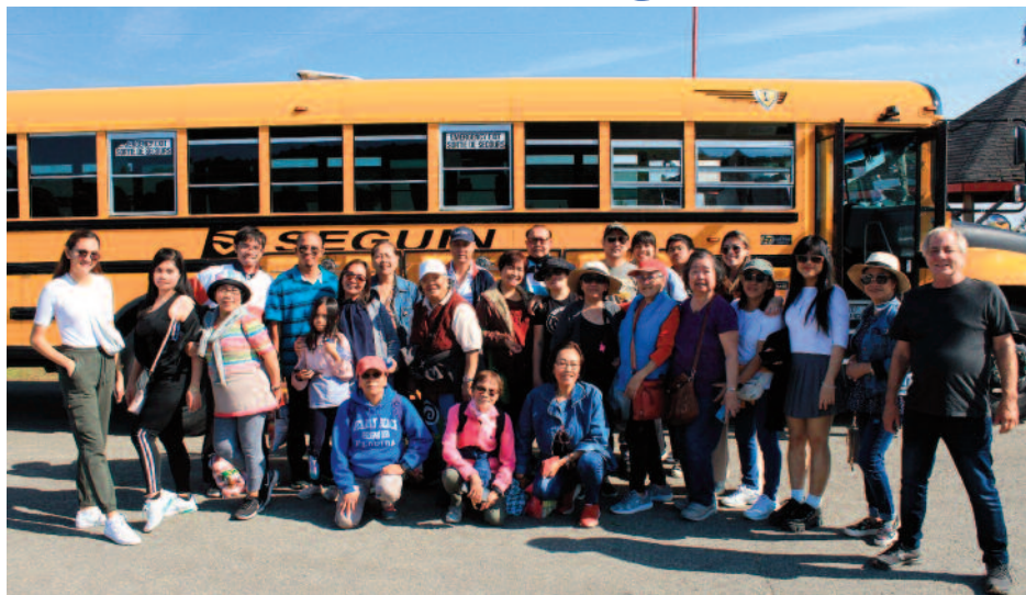
Gilmore College International apple picking trip, Sept. 24, 2023