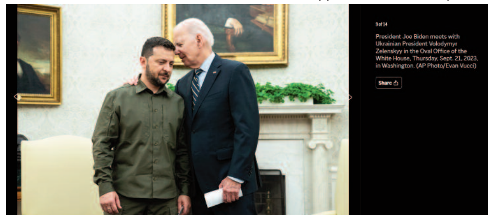
President Joe Biden meets with Ukrainian President Volodymyr Zelensky in the Oval Office of the White House, Thursday, Sept. 21, 2023 in Washington

“Considering the reluctance of many Republicans in U.S. Congress to further support Ukraine and the tensions between Ukraine and some of its key allies like Poland, Canada is seen as a reliable supporter of Ukraine