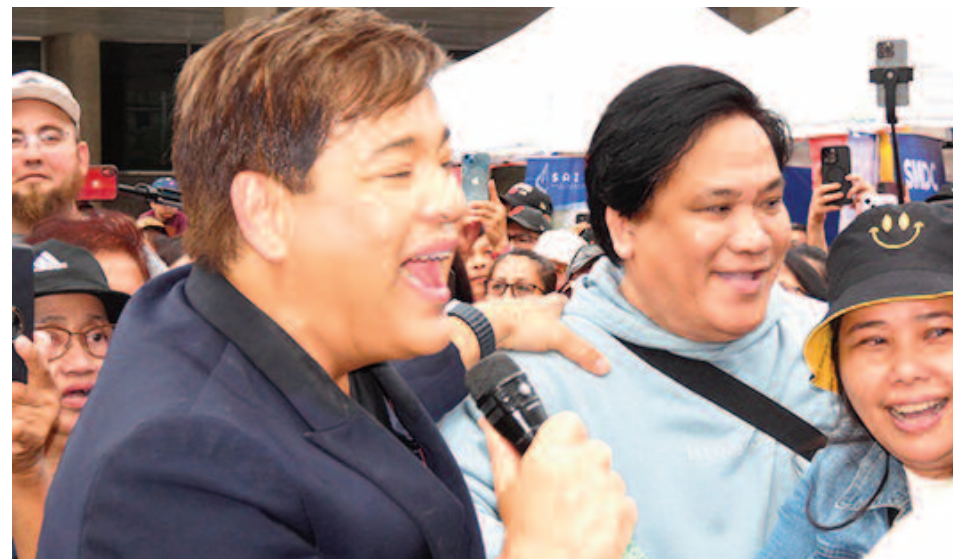
"Philippine Concert King" Martin Nievera at the Mabuhay Philippines Festival Show with Toronto Fans

organization in the Greater Toronto & Hamilton Area in Ontario.