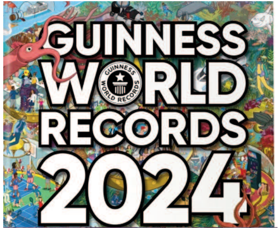
This image shows cover art for the latest edition of the Guinness World Records. The 2024 edition has taken our watery world as its theme. That means there's entries for the largest octopuses, largest hot spring and deepest shark among the 2,638 achievements.

NEW YORK (AP) — Do you know the highest average grossing movie franchise in history? That's easy, "Avatar." What about the record for the most balloons popped in one minute by a pogostick? Or the longest journey in a pumpkin boat?