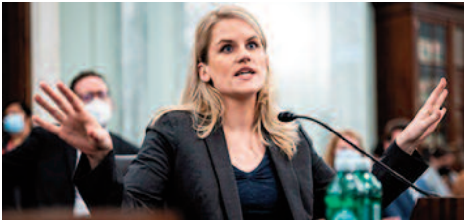
Frances Haugen said Facebook must declare "moral bankruptcy."