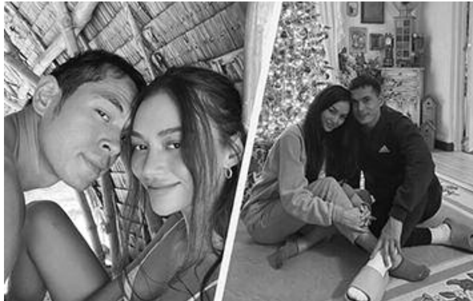
Celebrity couple Kylie Verzosa and Jake Cuenca

away, prompting the police to chase him and fire at the actor's vehicle.