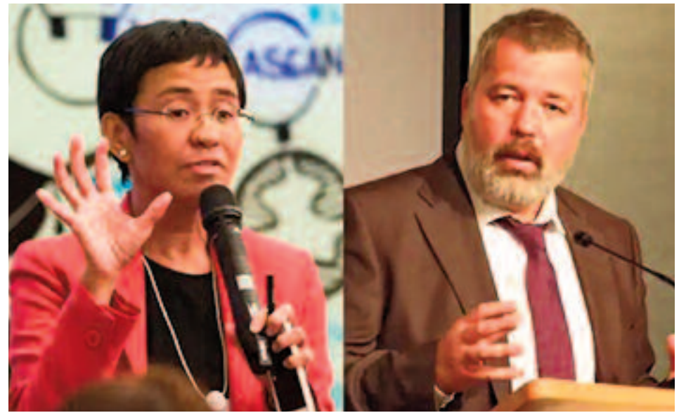
The Norwegian Nobel Committee has decided to award the Nobel Peace Prize for 2021 to Maria Ressa and Dmitry Muratov for their efforts to safeguard freedom of expression, which is a precondition for democracy and lasting peace. Oslo, October 8, 2021.