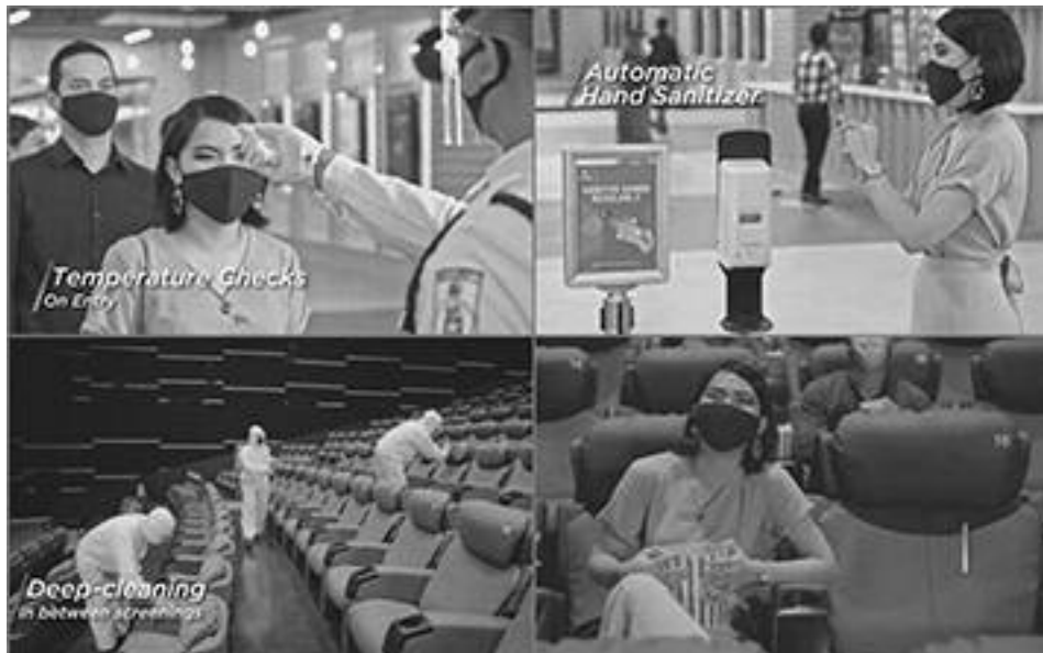
Health and safety protocols to be implemented in cinemas in the country

"It's Showtime" host Kim ChiCinemas and movie houses in the Philippines will strictly implement health protocols when these establishments reopen soon.