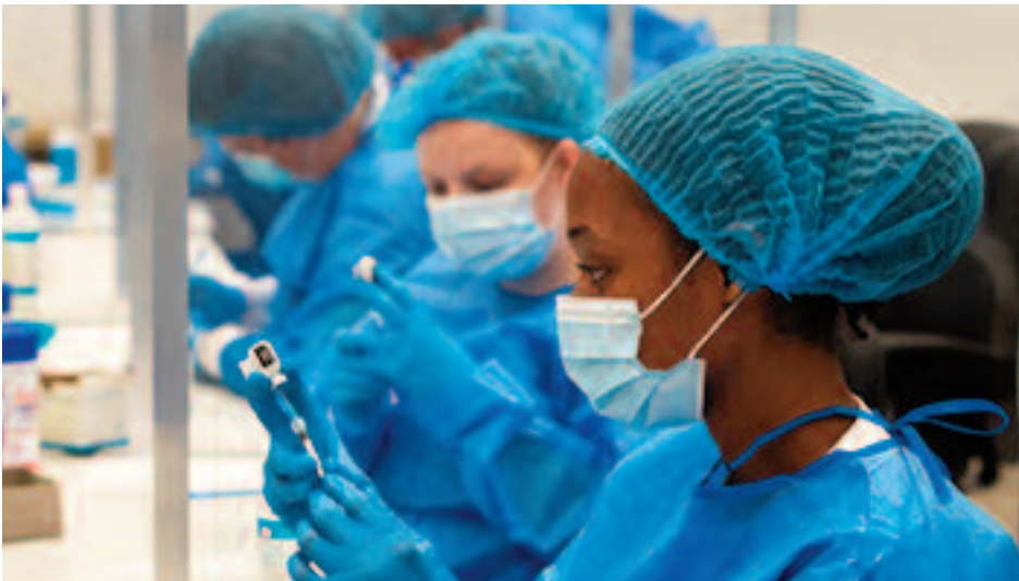
Health-care workers prepare doses of the Pfizer vaccine at a COVID-19 vaccination clinic, Thursday, May 13, 2021 in Montreal.