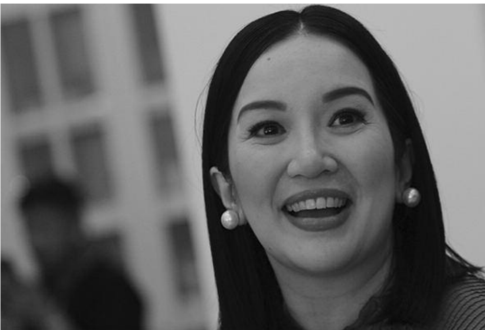
Actress and multimedia queen Kris Aquino is the new endorser of antihistamine brand Claritin.

Before the year ends, multimedia star Kris Aquino will be opening new branches of her fast food chain franchise.