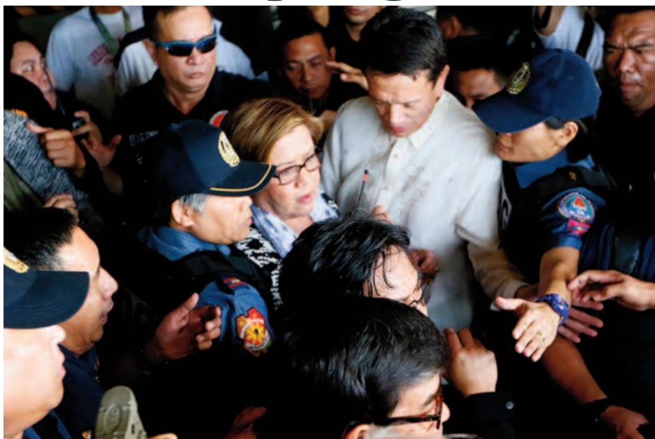
This was part of the recommendations made by a delegation of the IPU's human rights committee, which visited the country recently to check on the status of Sen. Leila de Lima and the extrajudicial killings under the Duterte administration.

Andanar said deploying a monitoring team to observe De Lima's case would be a "classic example of bullying." "We should stand up to this kind of meddling into our domestic affairs. Their intent is not to merely observe De Lima's trial by our laws, but to meddle in our democratic as well as judicial processes," Andanar said. "Over and over, pronouncements from the IPU portray the Philippines as a lawless nation when there is abundant evidence to the contrary," he added. De Lima was arrested last February 24 upon warrant issued by the Muntinlupa Regional Trial Court on drugs charges she says were hurled against her as part of a presidential vendetta.