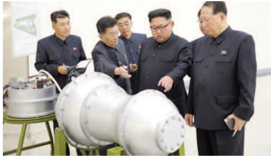
Kim Jong-un inspects weapon North Korea says is powerful hydrogen bomb

calls from the international community not to do so. Many experts believe those missiles - which North Korea