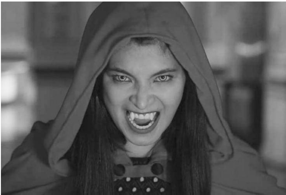
Angel Locsin as Jacintha Magsaysay in "La Luna Sangre."

The transformation of Jacintha Magsaysay (Angel Locsin) into a vampire in ABS-CBN's "La Luna Sangre" surprised viewers nationwide as the show hit a national TV rating of 34.1 percent versus GMA-7's "Alyas Robin Hood" (14.7 percent), according to data from Kantar Media released on Monday.