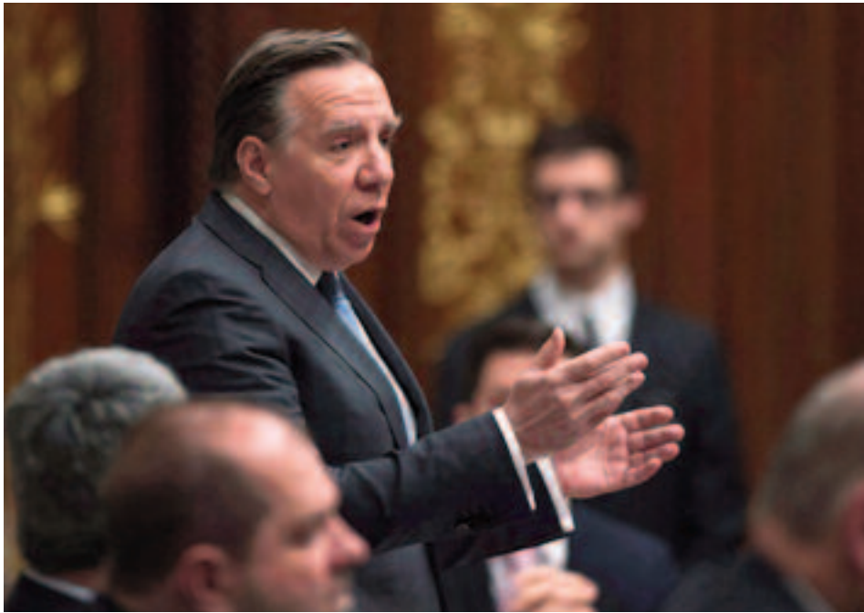
Coalition Avenir Québec Leader François Legault has played up identity issues in the lead-up to the 2018 provincial election.

EXPLAINER Answers to some key questions on Quebec's face-covering law