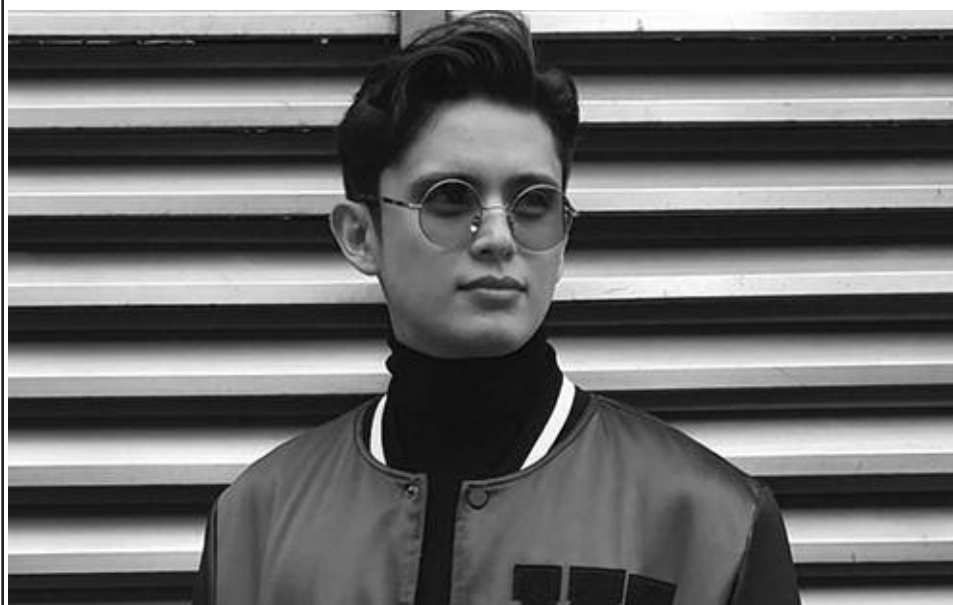
Filipino singer-actor James Reid

Filipino singer-actor James Reid has been nominated for Best Southeast Asia Act at the 2017 MTV Europe Music Awards (EMA), to be held in London on November 12.