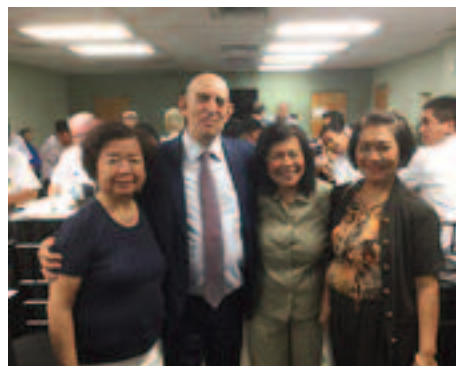
Souvenir photo taken during the visit of the singing priests from the Philippines