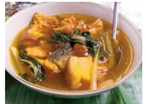
Filipino style pork and vegetable stew (Lauya)

1-2 kg pork knuckle if you dont want pork knuckles just use other cuts and add 2 to 4 pcs of pork leg bones 3 medium potatoes 3 eggplants 3-4 stalks chinese cabbages 2 green chilli 4-5 pcs star anise 1 stalk green beans 1 tbsp anatto seeds 1 large red onion salt pepper sugar fish sauce Method