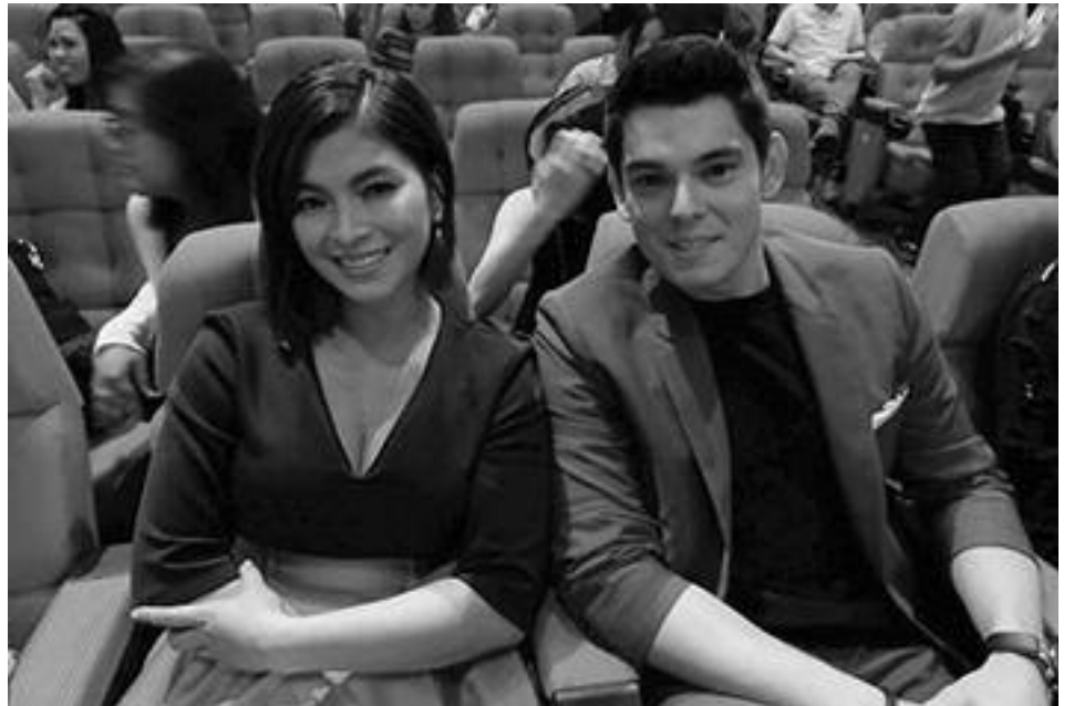
Angel Locsin and Richard Gutierrez

Fans of Angel and "La Luna Sangre" lead love team KathNiel (Kathryn Bernardo and Daniel Padilla) had mixed reactions about the emergence of Angel as a major