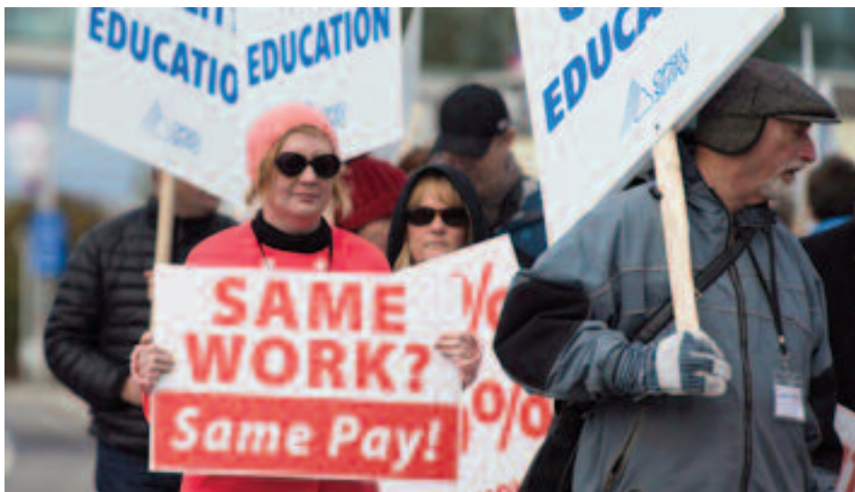
College faculty walk the picket line outside Algonquin College in Ottawa. The strikers want an equal ratio of part-time and full-time teachers.

Precarious work is a trend in the labour market in Canada in general, but it's not necessarily associated with the ivory towers of the country's post-secondary institutions. Universities and colleges, however, are increasingly putting faculty on short-term contracts instead of hiring them for full-time, permanent jobs.