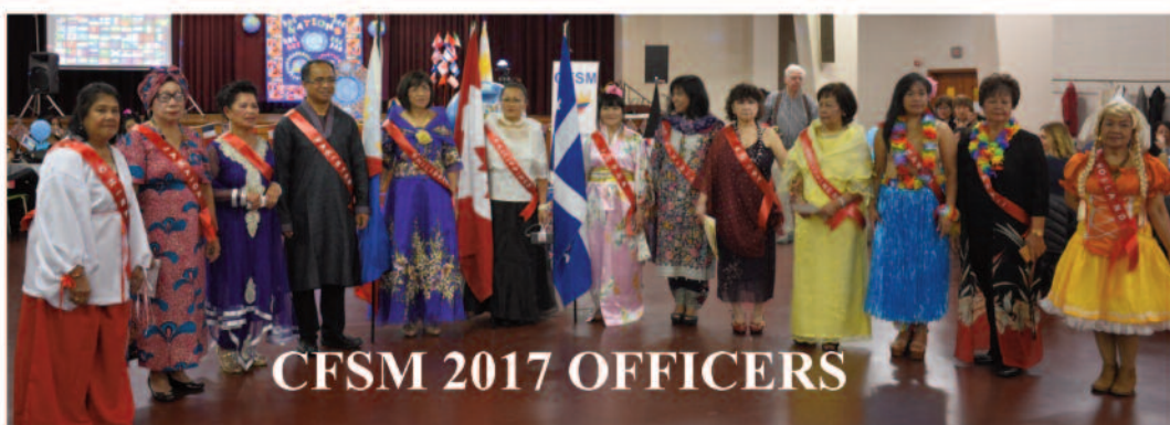
CFSM 2017 OFFICERS