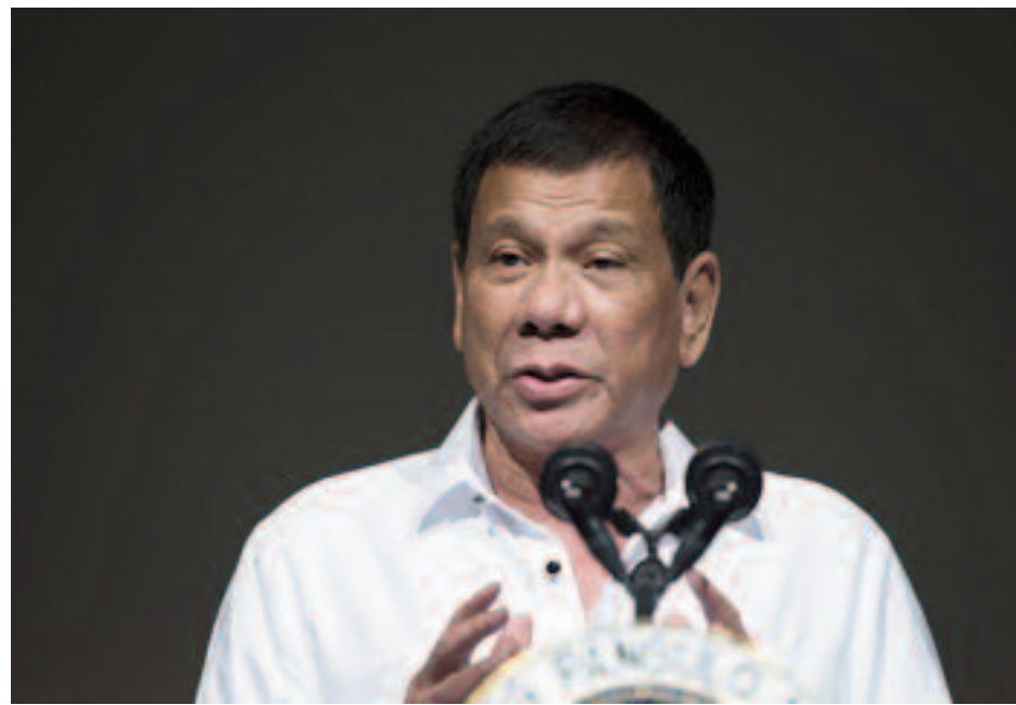
Rodrigo Duterte

president plans to raise are forced technology transfer, intellectual property theft, and reciprocal treatment for U.S. services companies