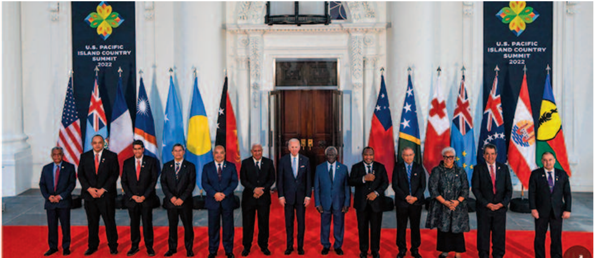
President Biden with Pacific Island leaders in Washington on Thursday, Sept. 30, 2022 - The United States and 14 Pacific Island nations signed a broad partnership agreement on Thursday at a summit in Washington, putting climate change, economic growth and stronger security ties at the center of an American push to counter Chinese influence in the region.