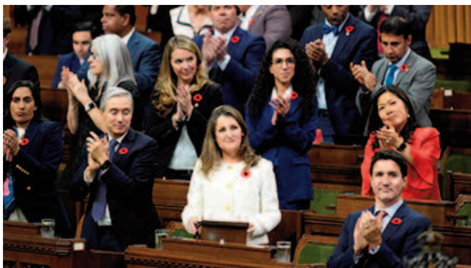
Deputy Prime Minister and Finance Minister Chrystia Freeland delivers the fiscal update in the House of Commons, in Ottawa, Thursday, Nov. 3, 2022.