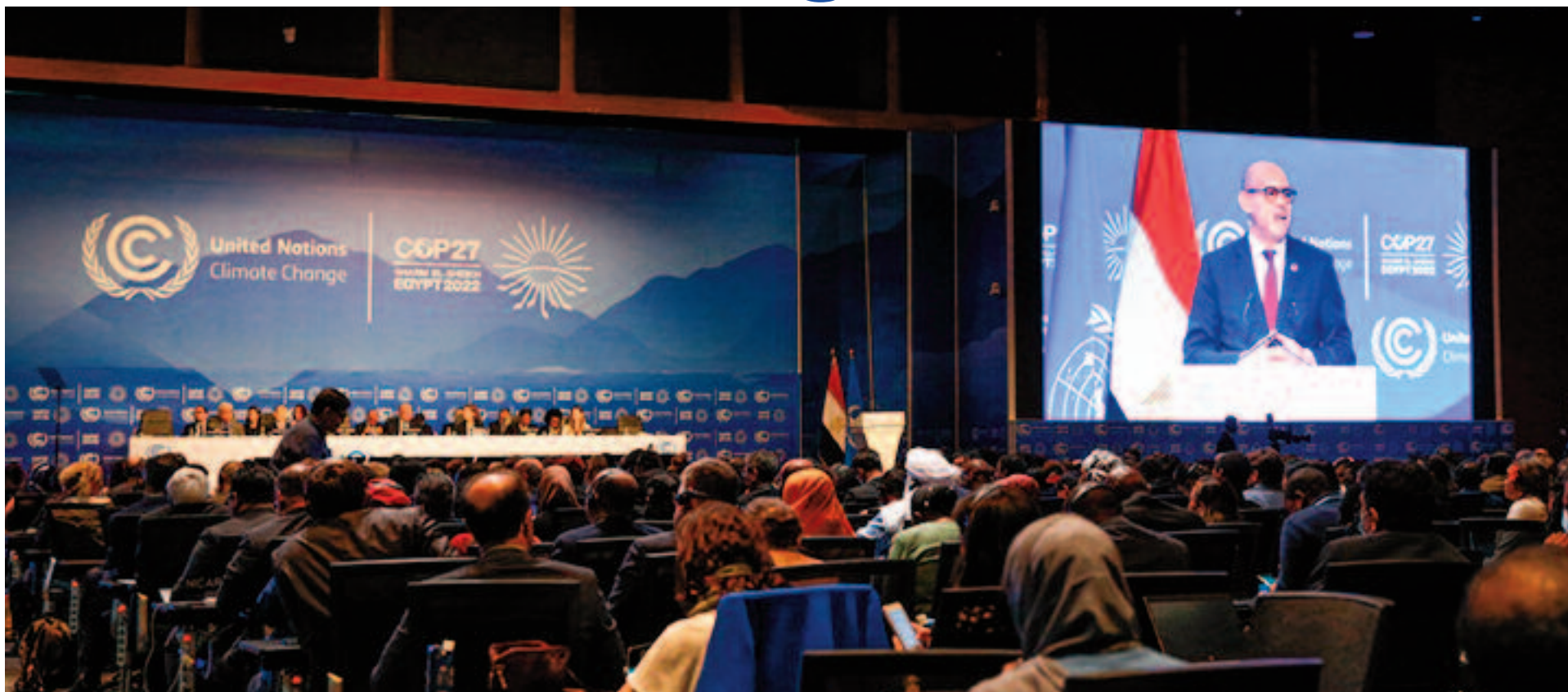
UN Climate Change Executive Secretary Simon Stiel delivering the opening remarks at the COP27 assembly of global leaders in Egypt.