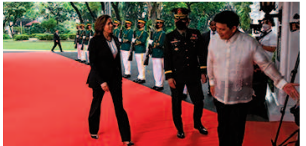
Philippines President Ferdinand Marcos Jr., right, welcomes Vice President Harris to Malacanang Palace in Manila on Nov. 21, 2022.

In 2016, a tribunal in The Hague ruled in favor of the Philippines in a maritime dispute, concluding China has