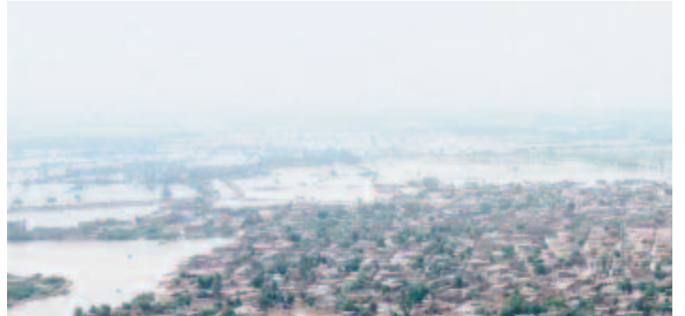
A flooded residential area in Jaffarabad, Pakistan, on Aug. 30 after floodwaters engulfed swathes of the country.

But the conversation will inevitably evolve. On Friday, Vanuatu announced that 86 countries now support its plan to request the International Court of Justice (ICJ), the