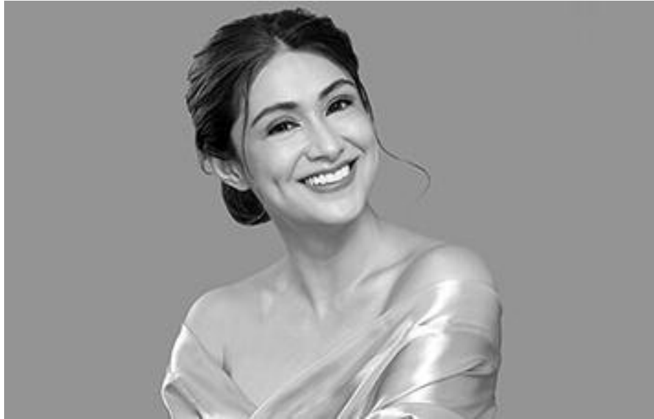
Actress Carla Abellana

Kapuso actress Carla Abellana said that she still believes in love after her breakup with husband Tom Rodriguez.