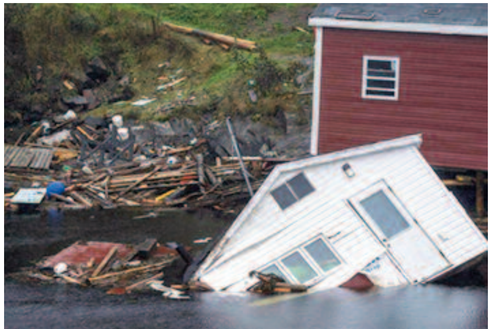
Buildings sit in the water along the shore following hurricane Fiona in Rose Blanche-Harbour Le Cou, N.L. on Tuesday September 27, 2022. The parliamentary budget watchdog says climate change has already begun to hurt the Canadian economy.