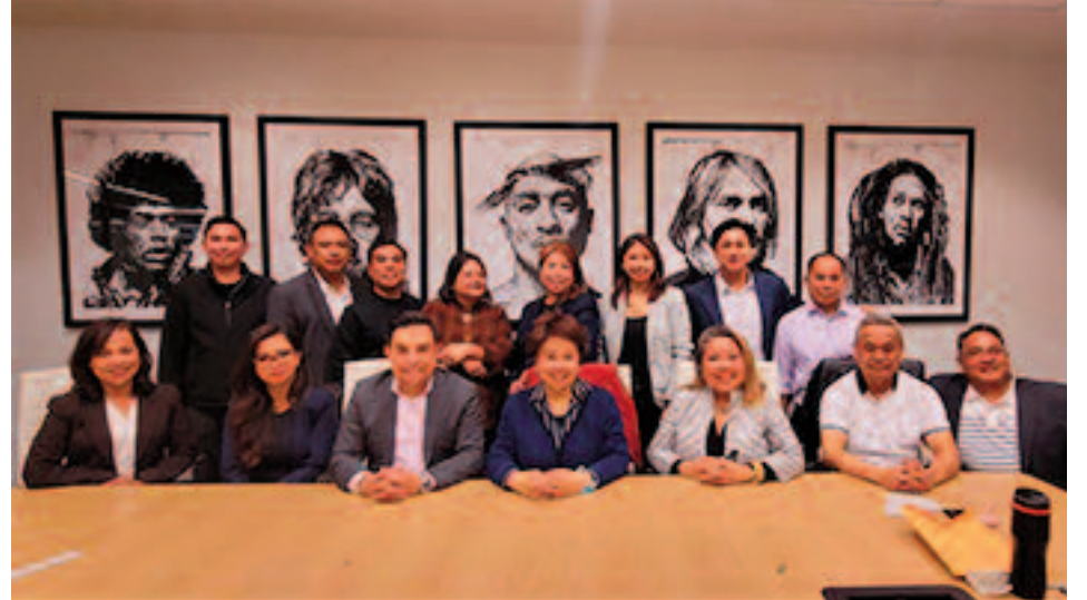
The 2023-2024 PCCT Board of Directors and Executive Officers

The Philippine Chamber of Commerce Toronto (PCCT) was formed in 1991 with its general mission being business growth and community development, that is, to encourage and promote bilateral economic ties between Canada and the Philippines and bring