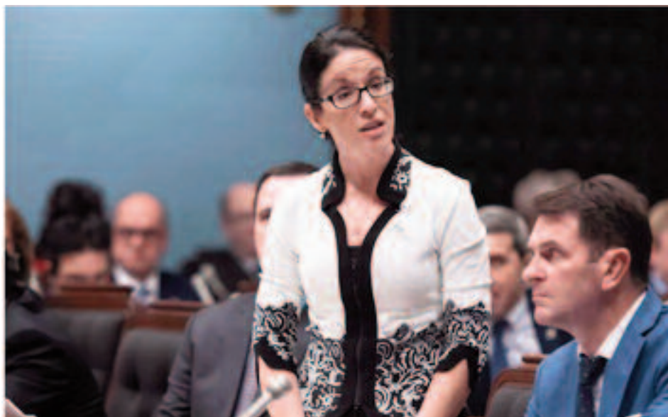
Quebec Justice Minister Sonia LeBel responds to the Opposition during question period December 5, 2018, at the legislature in Quebec City. Bill 39 introduced the electoral reform but was later shelved by the Legault government.