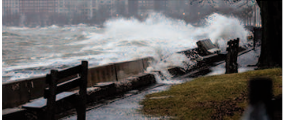
High waves hit the Lake Michigan shoreline near North Avenue in 2020. The harmful effects of climate change are a threat to the Great Lakes and the rest of the U.S. For those living near the Great Lakes who think they are somewhat insulated from the effects of climate change, a 1,695-word draft of a National Climate Assessment report released Monday, Nov. 7, 2022 included some sobering news: Lakes face a growing threat of hazardous algae blooms. That includes Lake Michigan, the source of drinking water for Chicago and many suburbs. (Chicago Sun Times, Nov. 10, 2022)