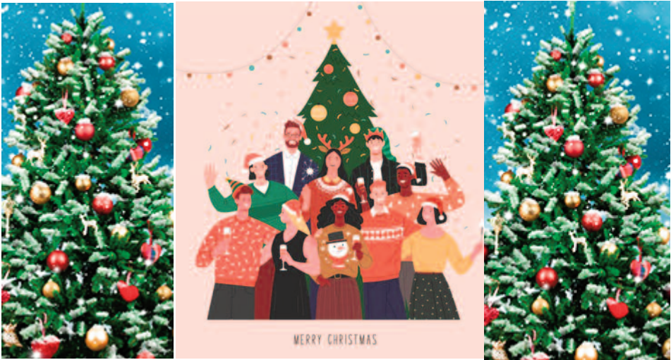
Souvenir of Christmas Fellowship Party at Gilmore College International