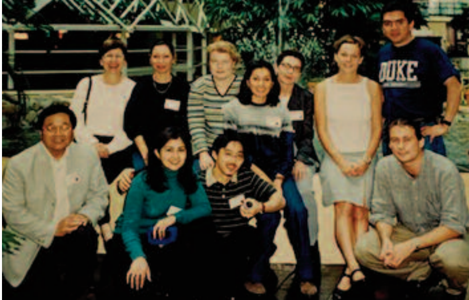
V.I.F. teachers from the Philippines, Spain, Peru, France, Germany, Venezuela, Mexico, Uruguay in New Jersey, U.S.A.

The VIF name was a trademark that embodied commitment to education, highly qualified teachers, service and leading-edge technology.