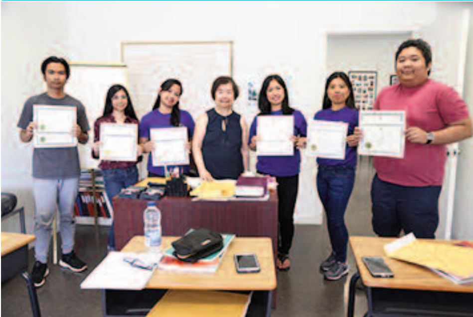
French class 2019 Levels 1 and 2 Proficiency Certificates presentation These students continued to complete level 3, but only 4 completed Level 4.