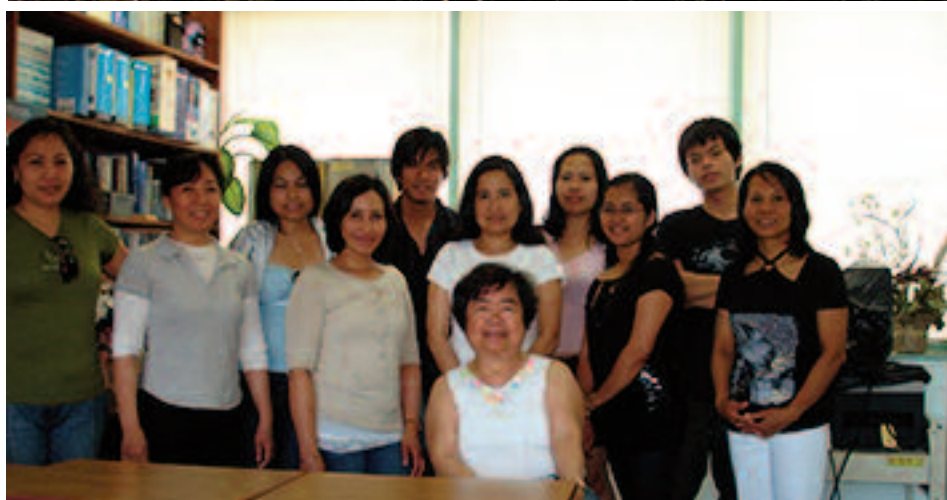
Souvenir photo of French students in 2006 at 4950 Queen Mary Penthouse