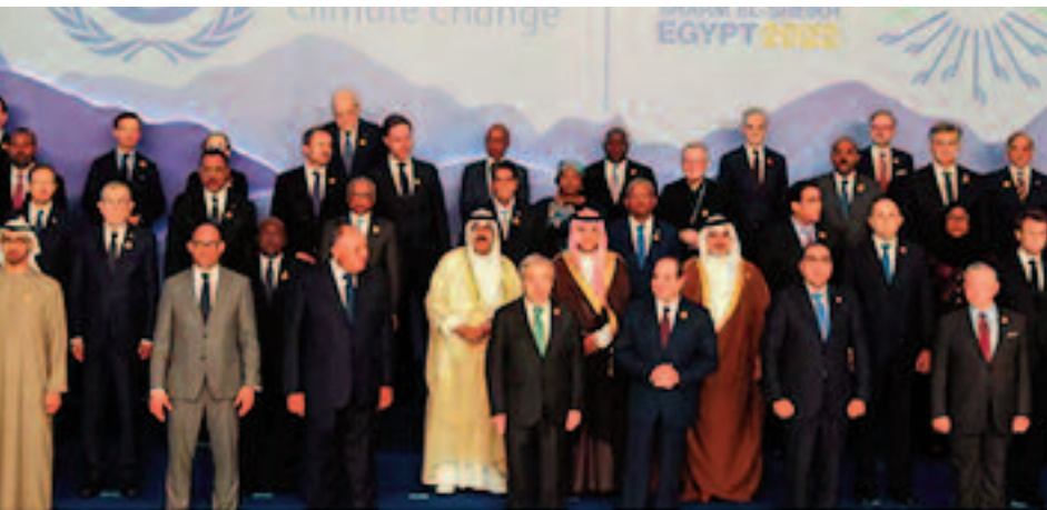
United Nations Secretary General Antonio Guterres told countries gathered at the start of the COP27 summit in Egypt on Monday they face a stark choice: work together now to cut emissions or condemn future generations to climate catastrophe.