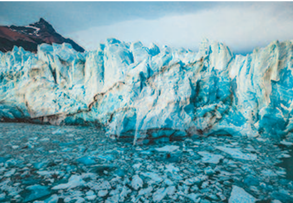
"The modelling suggests that under conditions where anthropogenic greenhouse gas emissions peak during the 2030s and decline to zero by 2100, global temperatures will be 3°C warmer and sea levels 3 metres higher by 2500 than they were in 1850," according to an excerpt from a paper by researchers of the Norwegian Business School in Oslo. 2500 is a long way off, but it suggests the bill will come due eventually, unless globally societies extract 33 gigatonnes of carbon from the atmosphere from "2020 onward".