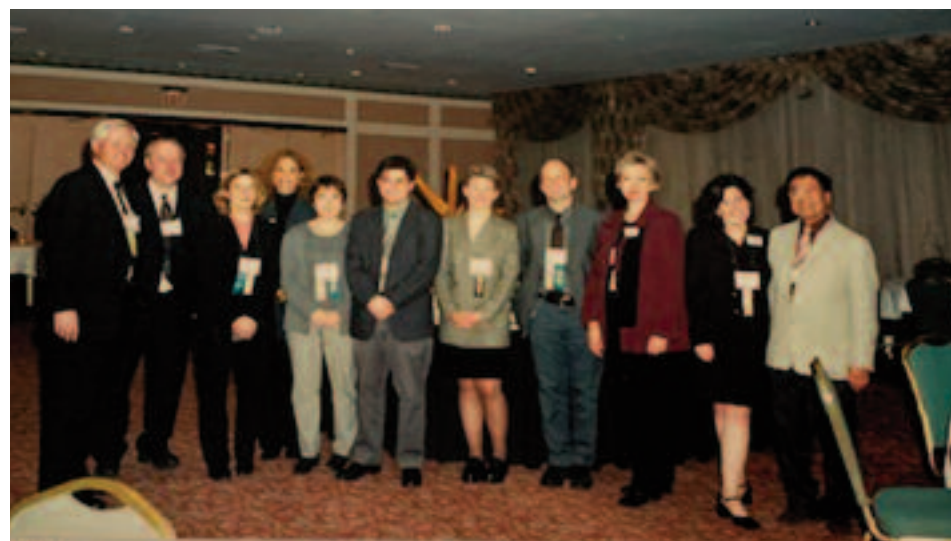
VIF International Education Fellows at the NECTFL Conference on the teaching of Modern Languages at the Manhattan Hilton, New York City.

amongst thousands of worldwide applicants to join the corps of international educators in Chapel Hill, North Carolina for a week of orientations, workshops, conferences before reporting to designated schools and districts