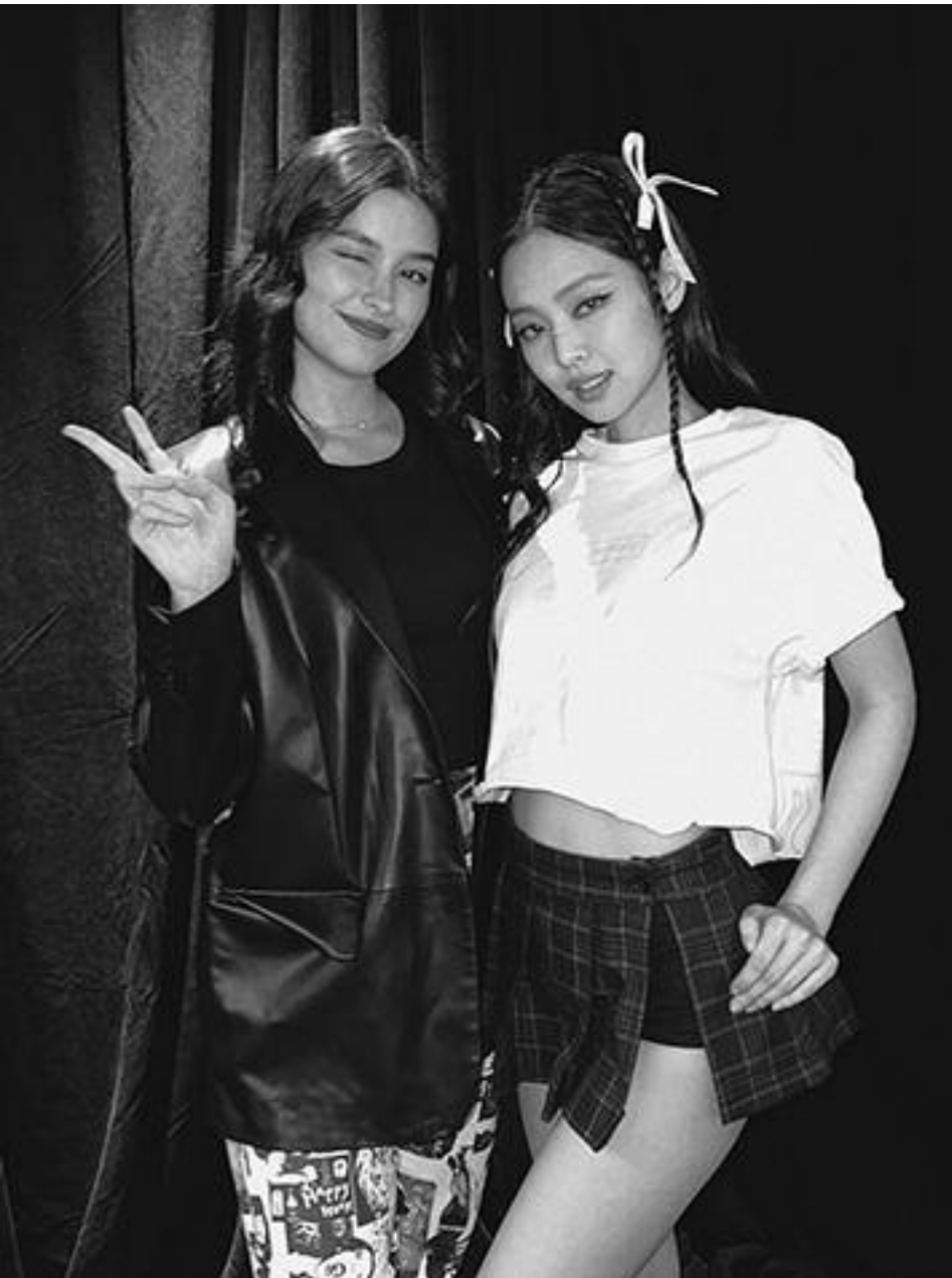
Liza Soberano with Blackpink's Lisa

Actress Liza Soberano became viral recently amid "laos" claims when photos of her "fangirling" with Blackpink members Jennie and Lisa at the backstage of the Korean all-girl group's concert in Los Angeles trended online. Liza also filled her Instagram story videos of Blackpink in concert. In her Instagram account last Monday, Liza posted a photo of her with Jennie. "I'm the happiest girl @jennierubyjane," Liza captioned the post. Liza's record label Careless Music, meanwhile, posted a photo of Liza, Destiny Rogers and Lisa. "Careless queens with the one & only @lalalalisa_m," the record label captioned the post. A known Blink, Liza has been vocal for her love and support for the Korean all-girl group. ■