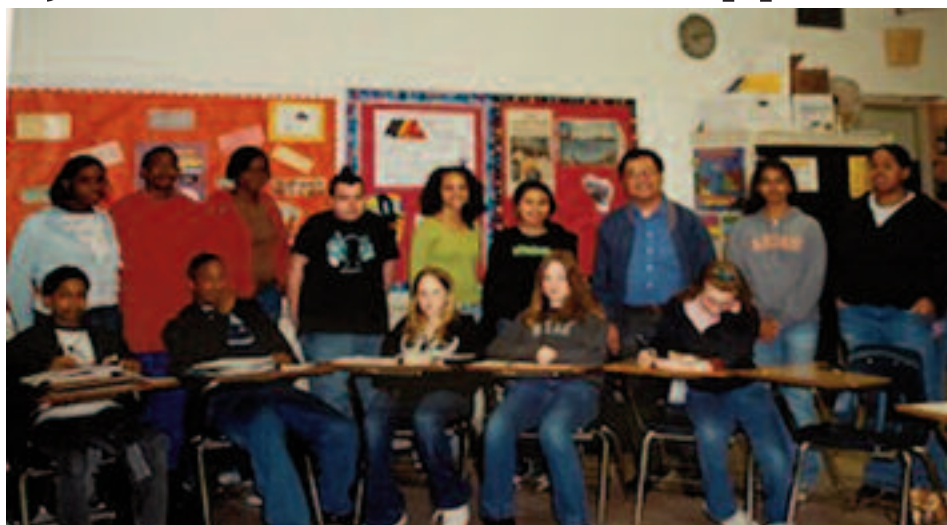
French class students at the Syms Middle School in Hampton, Virginia.

It was a moment of pride to be the first Filipino teacher selected from