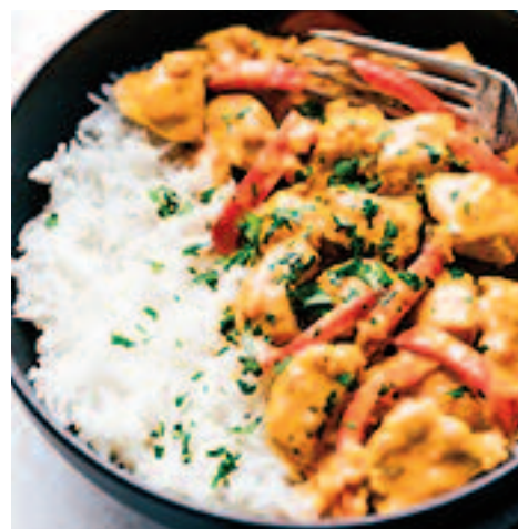
Coconut Chicken Curry

You probably won't need all the sauce because it is very strong in flavour. Save the leftovers and use it to make fried rice! It is perfect because it is so strong in flavour so a little bit goes a long way.