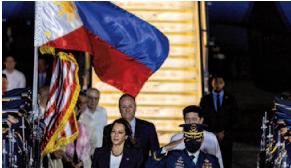
US Vice President Kamala Harris and her husband Doug Emhoff arrive at Ninoy Aquino International Airport in Manila November 20, 2022.

Enhanced Defense Cooperation Agreement (EDCA) between the two countries, which allows US troops to use agreed locations in the Philippines for security exercises and joint military training, the White House said in a statement.