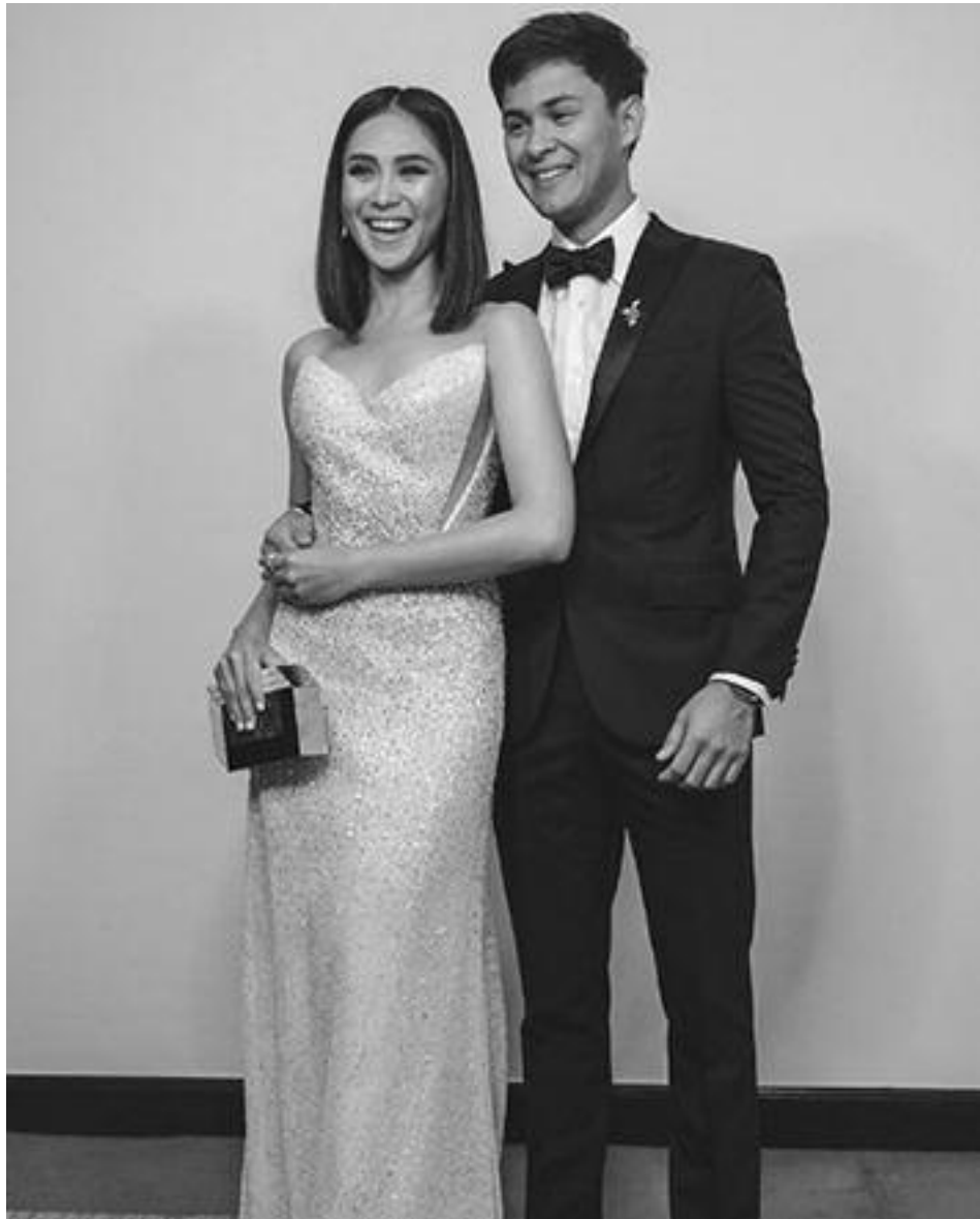
Sarah Geronimo and Matteo Guidicelli have been a couple since 2013.