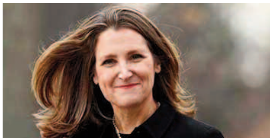
Liberal MP Chrystia Freeland arrives for the cabinet swearing-in ceremony in Ottawa on Wednesday, Nov. 20, 2019.

Marco Mendicino becomes minister of immigration, refugees and citizenship