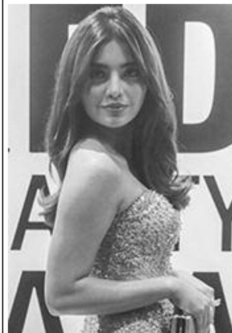
Jane De Leon at the 2019 Red Charity Gala

Kapamilya actress Jane De Leon admitted that she felt tired once in showbiz after getting rejections from different roles.