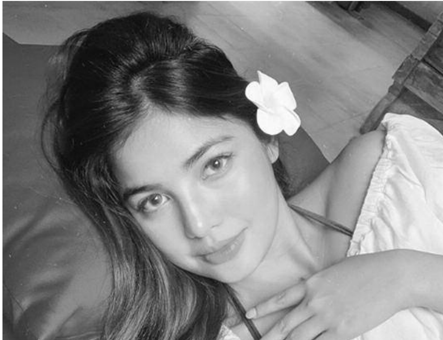
Jane de Leon

Jane de Leon makes sure to keep her feet on the ground despite being the newest "Darna" star by recalling how she entered the showbiz industry.