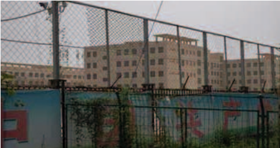
A re-education camp for ethnic Uighur Muslims in Hotan, in China’s Xinjiang province in August.