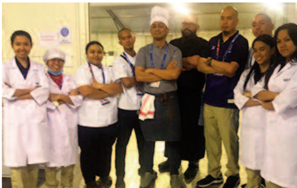
SEA games chefs in Subic assure athletes of halal food.