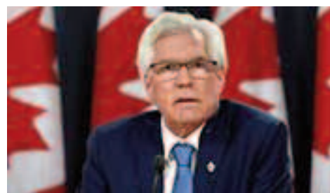
Jim Carr, Special Representative to the Maritime Provinces

Former cabinet minister Jim Carr, who represents a Winnipeg riding, has been named as Trudeau's "special representative" for the Prairie provinces.