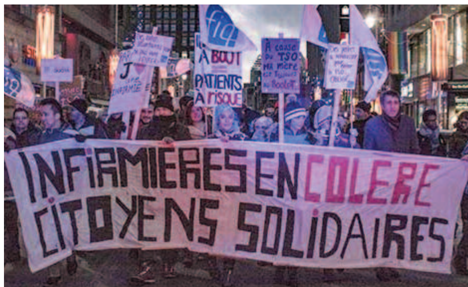
Quebec's largest nurses union is calling attention to burnout and mandatory overtime issues with strike action.

PRESSE CANADIENNE Updated: November 26, 2019