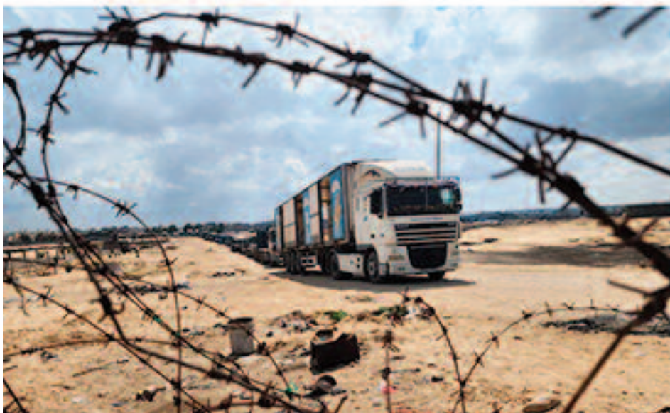
Palestinian truck drivers and United Nations vehicles wait near the Rafah border gate on the Gazan side to cross the Egyptian side after the Israeli army took control of the vital crossing and announced that it would close the entrance of aid supplies, as Israeli operations continue in Rafah, Gaza on May 14, 2024.