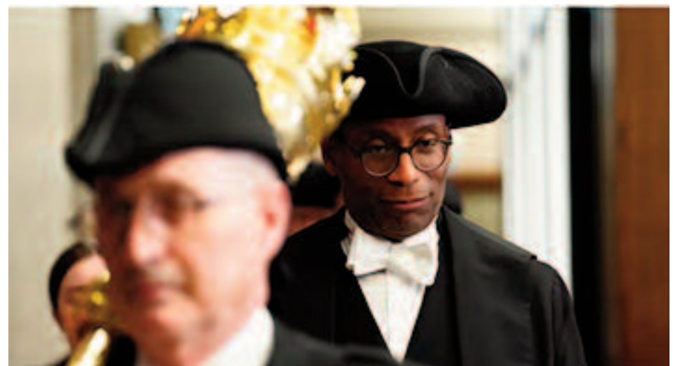
Speaker of the House of Commons Greg Fergus takes part in the Speakers Parade prior to question period on Parliament Hill in Ottawa on Wednesday, May 1, 2024.