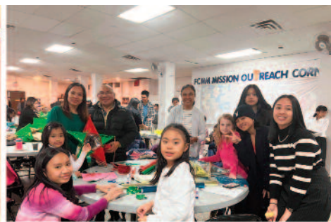
Thank you to members of Family Life Ministry for sharing your time with the children and their parents.