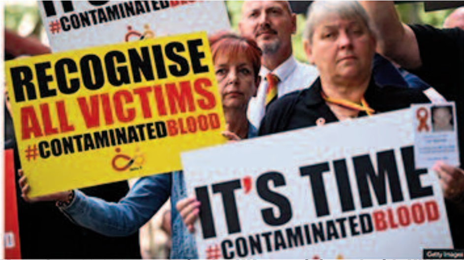
More than 30,000 people in the UK were infected with HIV and Hepatitis C after being given contaminated blood products in the 1970s and 1980s.

A public inquiry into what has been called the biggest treatment disaster in NHS history will announce its findings on Monday. Victims are campaigning for compensation.