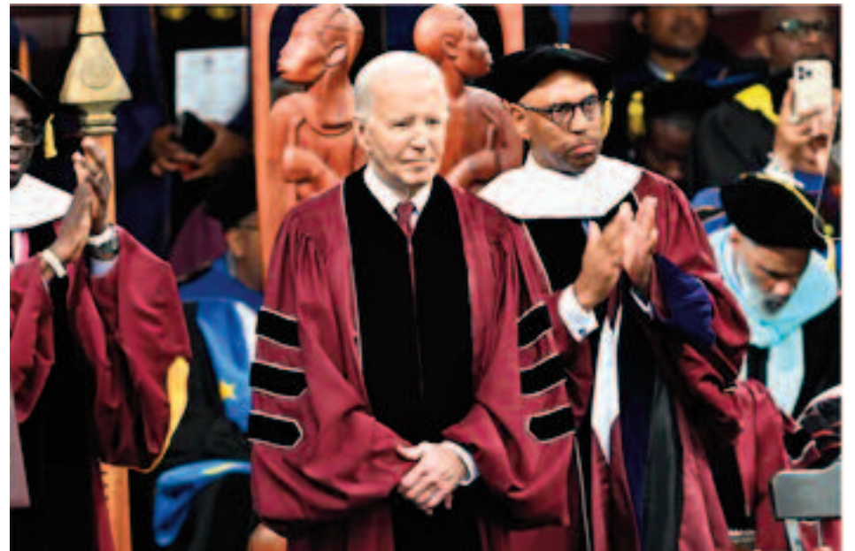
President Joe Biden receives an Honorary Doctor of Laws degree from Morehouse College during the 140th Morehouse College Commencement ceremony on May 19, 2024 in Atlanta, Georgia.