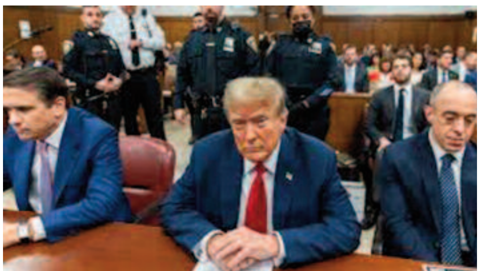
Donald Trump's former lawyer Michael Cohen has given a third day of testimony at a New York court in the ex-president's hush-money trial. The defence has attacked Cohen's credibility as a witness, highlighting his convictions for lying to Congress and other criminal charges. Cohen, who once said he would take a bullet for Trump, testified he lied out of "loyalty" and to "protect" Trump when he was his personal counselor.