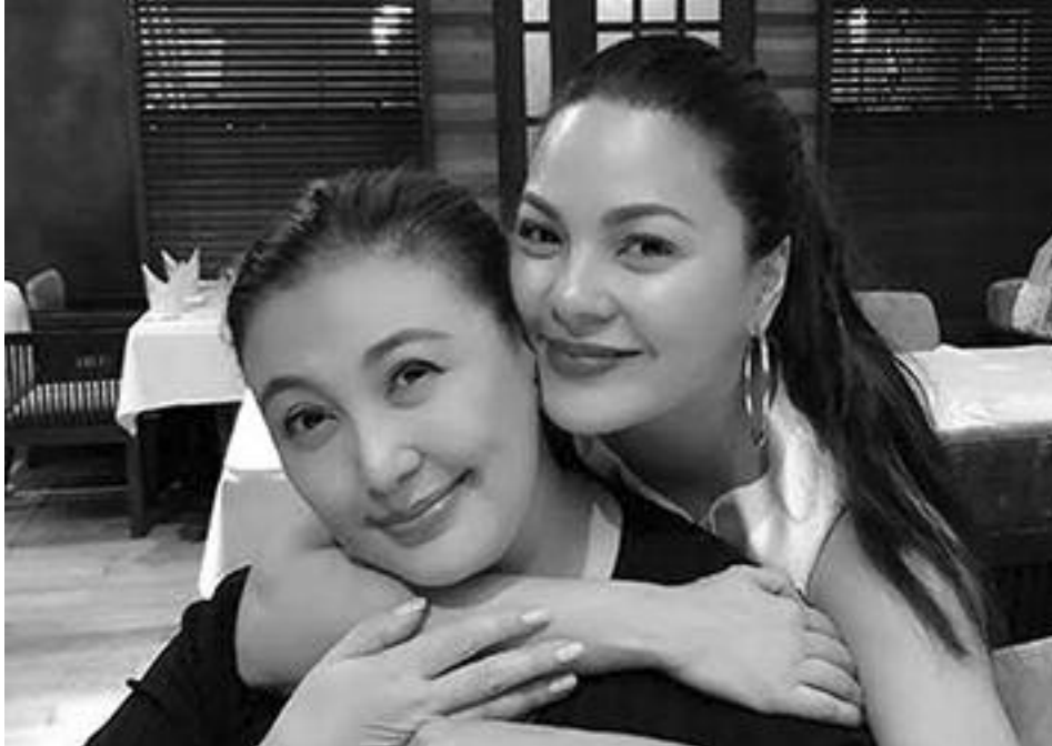
Sharon Cuneta with daughter KC Concepcion

KC Concepcion took to her Instagram to greet her mom and actress Sharon Cuneta on Mother's Day despite being "estranged" from each other.