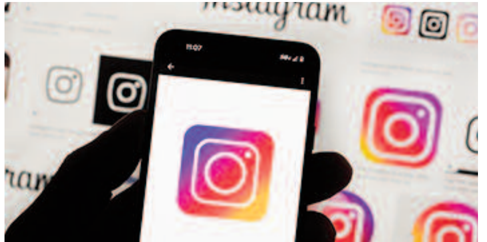
File - The Instagram logo is seen on a cell phone in Boston, Oct. 14, 2022.

Last month, his minister responsible for social services, Lionel