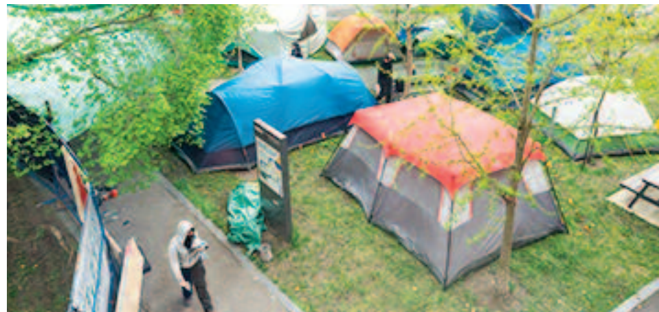
A member of the pro-Palestinian encampment at UQAM walks around

space between the camp and the buildings in the courtyard, including around the Pavillon Cœur des sciences, "to not hinder the circulation of people using the space."