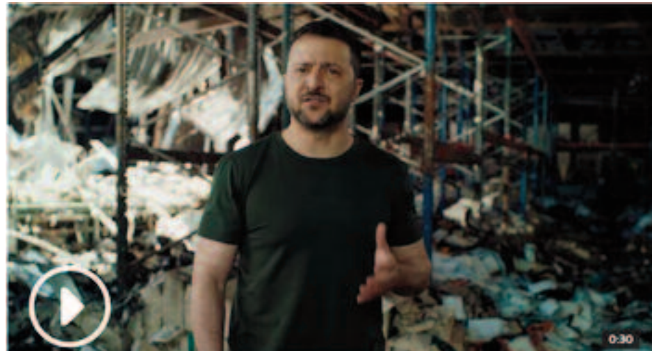
President Volodymyr Zelensky has directly called on his US and Chinese counterparts to join his latest summit for peace in Ukraine.

China has resisted calls by NATO and its member states to take a direct stance against Russia in support of Ukraine. President Xi hosted Russian leader Vladimir Putin in a show of "friendship" earlier this month.