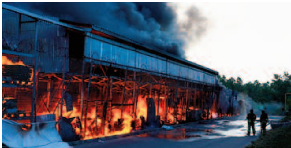
Several people have been killed after a crowded DIY store in the Ukrainian city of Kharkiv was hit by Russian strikes, regional officials say.