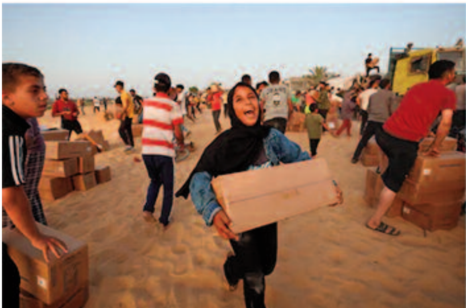
Palestinians carry boxes of humanitarian assistance after rushing the trucks transporting the international aid from the new U.S.-built temporary floating pier near Nuseirat in the central Gaza Strip on Saturday.

A wildfire of note is determined to be of significant public interest and may pose a threat to public safety, communities or critical infrastructure.