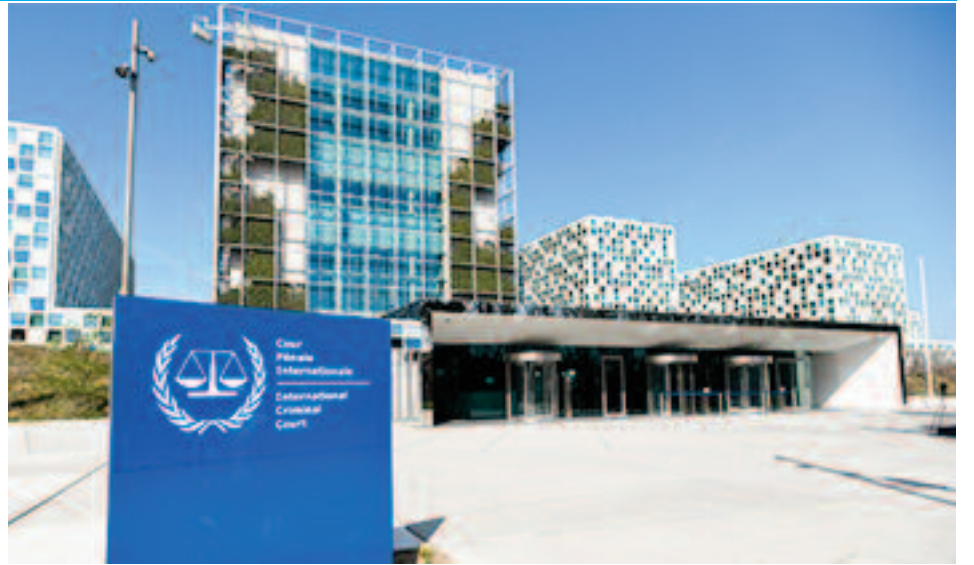
The International Criminal Court building at the Hague, Netherlands

The role of criminal prosecutions both during and after armed conflicts has long been debated. The existence of the ICC is intended to encourage compliance with international criminal law, to support countries to conduct their own investigations and prosecutions, and to fill gaps left by domestic processes. Yet the prosecutor is also a political actor with an interest in promoting the ICC's institutional legitimacy and clout. The prosecutor's May 20 statement emphasized the importance of judicial and prosecutorial independence—a clear reference to threats and political pressure targeting the ICC. In addition, he emphasized the importance of public perceptions that the court is not