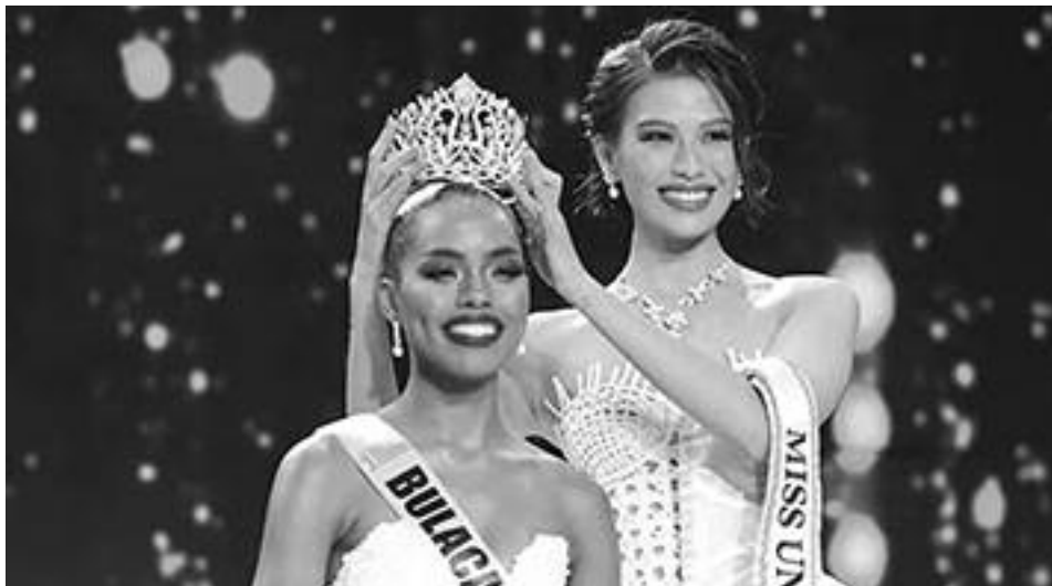
(From left) Chelsea Manalo and Michelle Dee. Image

Content creator and actress Michelle Dee expressed her support to her successor, Miss Universe Philippines 2024 Chelsea Manalo, as she advised the latter to “lead by example” throughout her reign.