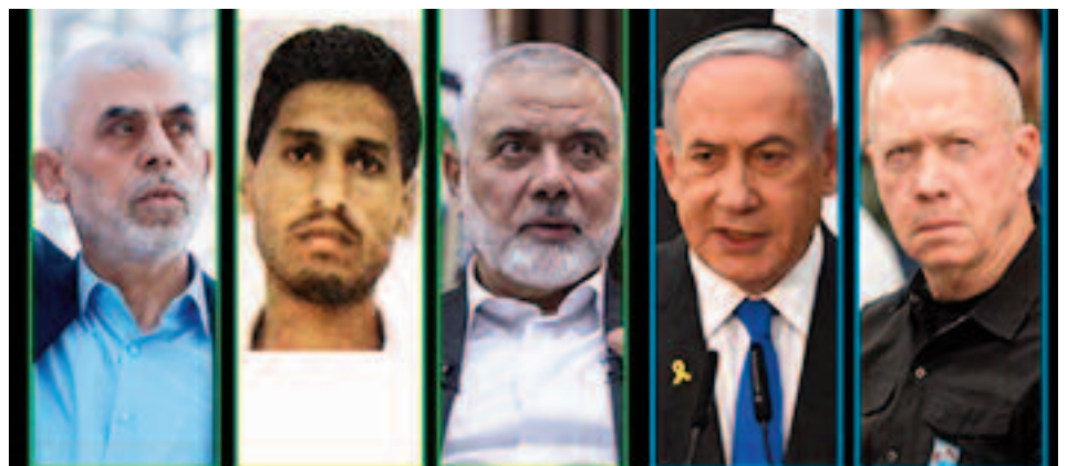
Yahya Sinwar (head of Hamas in Gaza), Mohammed Diab Ibrahim Al-Masri (also known as Mohammed Deif, the commander of the military wing of Hamas) and Ismail Haniyeh (head of Hamas' political bureau, based in Qatar) Israel Prime Minister Benjamin Netanyahu, and Defense Minister Yoav Gallant. Karim Khan, ICC Prosecutor believes they are responsible for war crimes and crimes against humanity in the Gaza Strip and Israel. The prosecutor must request the warrants from a pre-trial panel of three judges. A decision could take weeks.

The opinions expressed by the writers and columnists do not necessarily reflect that of the management of the North American Filipino Star nor its editors.