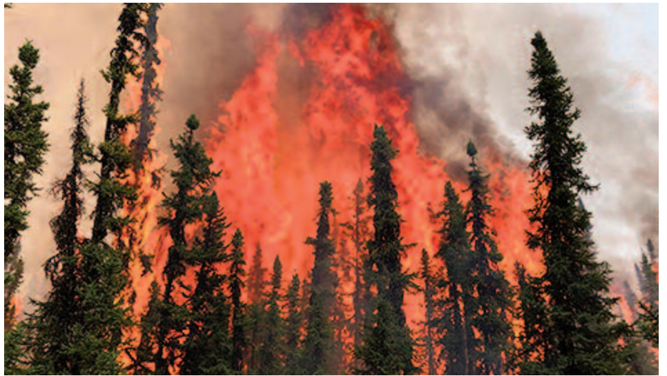
Wildfires of note in Alberta

A public inquiry into what has been called the biggest treatment disaster in NHS history will announce its findings on Monday. Victims are campaigning for compensation.