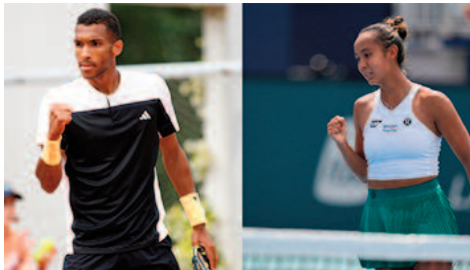
Felix Auger-Aliassime from Montreal and Leylah Fernandez from Laval won their matches at the French Open on May 27, 2024.