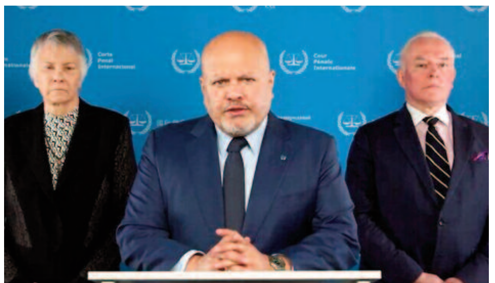
Karim Khan, the chief prosecutor of the International Criminal Court (center), announces he is seeking arrest warrants from the court's judges for Prime Minister Benjamin Netanyahu and Defense Minister Yoav Gallant, along with Hamas leaders Yahya Sinwar, Mohammed Deif and Ismail Haniyeh, May 20, 2024.