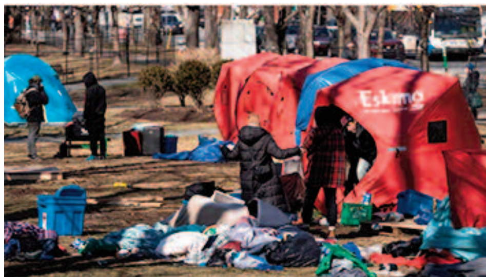
Street navigators help relocate residents from the homeless encampment in Victoria Park in Halifax's downtown on Monday, March 4, 2024.

it comes to the moves the government has made on housing over the last year. But they also argue there's