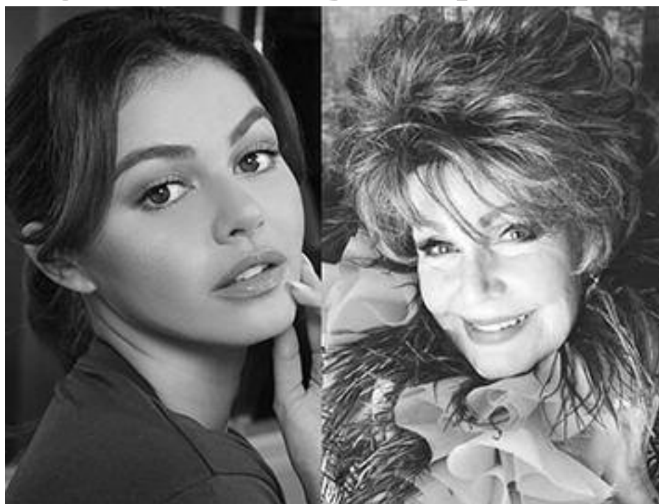
Combination photo shows Kapamilya actress Janine Gutierrez and her grandmother Pilita Corrales.