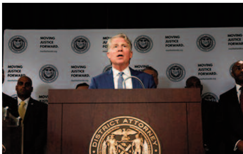
Manhattan District Attorney Cyrus Vance Jr., shown here in 2019, is in possession of former President Donald Trump's tax returns.

successful businessman, he broke decades of presidential precedent by refusing to release his tax returns during and following the 2016 campaign. He also did not divest from his family business, raising concerns about financial entanglements and potential conflicts of interest, particularly with foreign leaders.