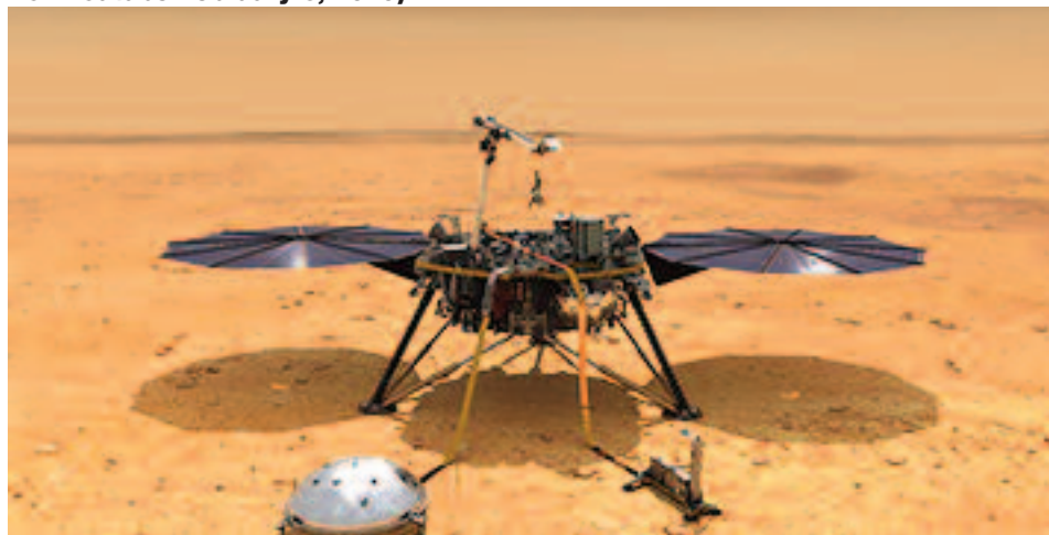
The Mars InSight lander is equipped with a domed seismometer (left) and a probe for measuring heat flow (right).

issue As a result we have added more information online (Traveller Expectations, Hotel Responsibilities etc.) , increased operators to answer basic questions, as well as agents to book hotels. I have requested that we have an online system set up soon as well.