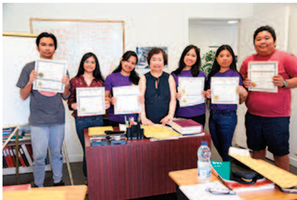
Sunday French Class 1 & 2 Certificates

7159, ch. Côte des Neiges Montreal, QC H3R 2M2 Tel.: 514-485-7861 Cellphone: 514-506-8753