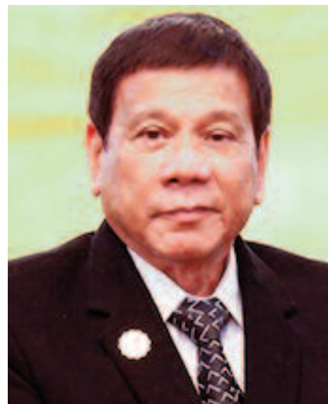
Phil. Pres. Rodrigo Duterte