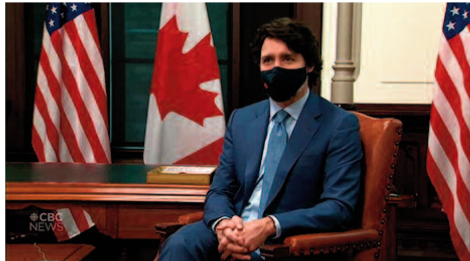
Prime Minister Justin Trudeau

"U.S. leadership has been sorely missed over the past years," Trudeau told Biden in a thinly veiled reference to Donald Trump.