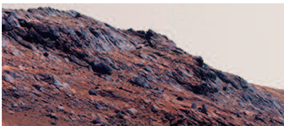
New Mars Curiosity Rover Pictures of the Martian mountain Mount Sharp (taken from Youtube February 6, 2020)

We are aware of reports of long wait times. Along with other caucus members I have advised the Ministers responsible and their departments that we need to fix this