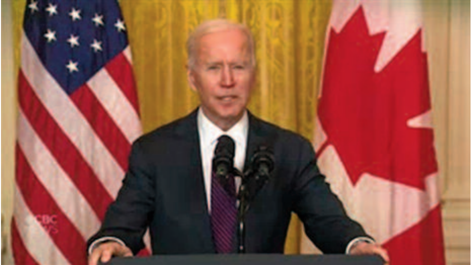
U.S. President Joe R. Biden.

WASHINGTON — President Joe Biden held the first bilateral meeting of his presidency Tuesday with Canadian Prime Minister Justin