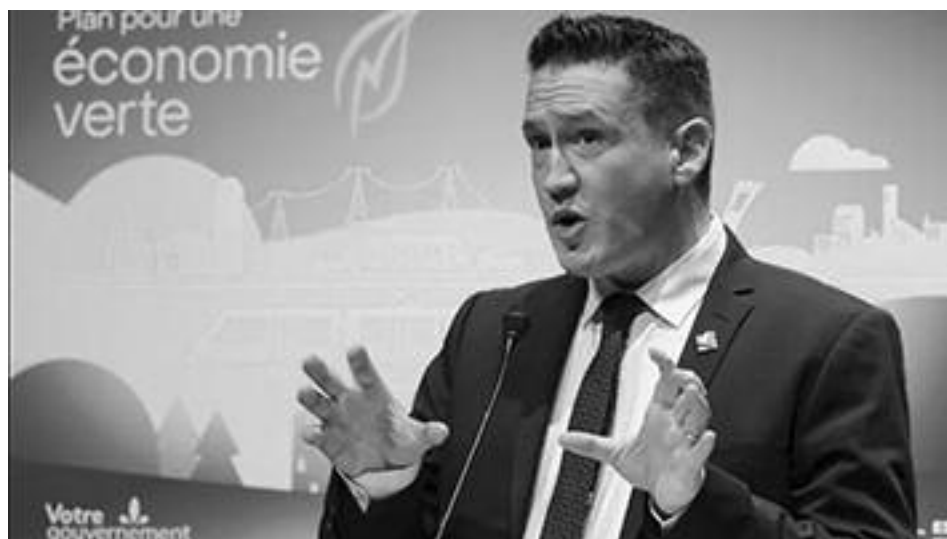
Quebec Environment Minister Benoit Charette, shown here announcing the province's green plan in Nov. 2020, said he wants to get to work on the 25 recommendations made by the anti-racism committee formed by the Quebec government last spring.

"We can't deny that people from minority groups, and Indigenous people, are too often exposed to profiling, to disparities in how they are treated, notably in matters of housing, in matters of employment," said Charette.