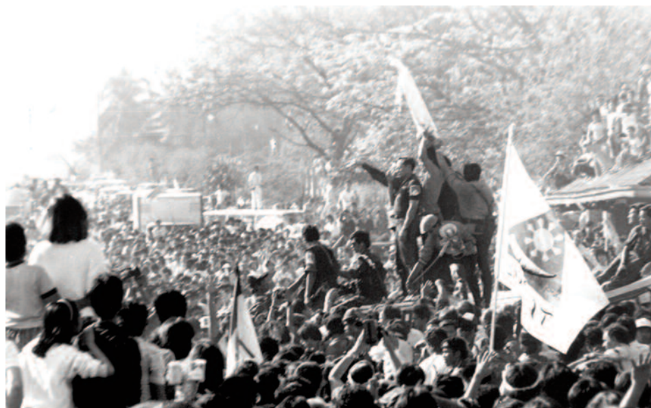
DEFIANCE Lt. Gen. Fidel V. Ramos, then AFP vice chief of staff, and Defense Minister Juan Ponce Enrile rally their civilian supporters outside Camp Crame on Edsa shortly after they broke away from President Ferdinand Marcos. The four-day standoff that ousted the Marcoses became known as the People Power Revolution.

"The challenge now is this: We must find within ourselves that strength, that faith, that fire to continue the work that remains to be done. And in doing so, we must find a way to walk forward together," she said in a separate statement.