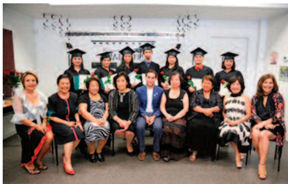
PAB Batch 12 graduation, July 8, 2017