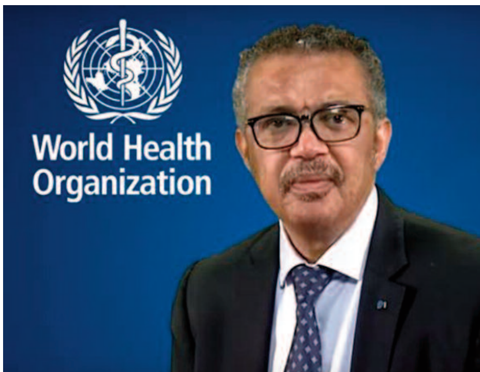
WHO Chief, Dr. Tedros Adhanom Ghebreyesus, warns against under-estimating the dangers of Omicron.

While the variant may increase the chances of breakthrough