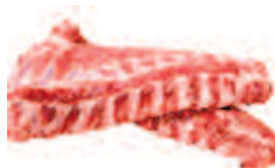
Pork spare rib $2.05-lb