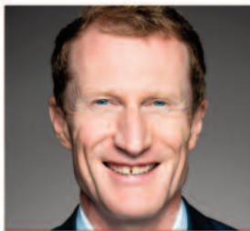
HON. MARC MILLER