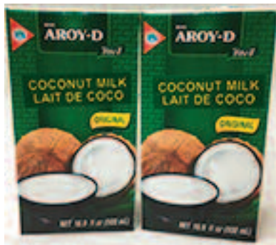
Aroy D coconut milk 1L $4.49-ea