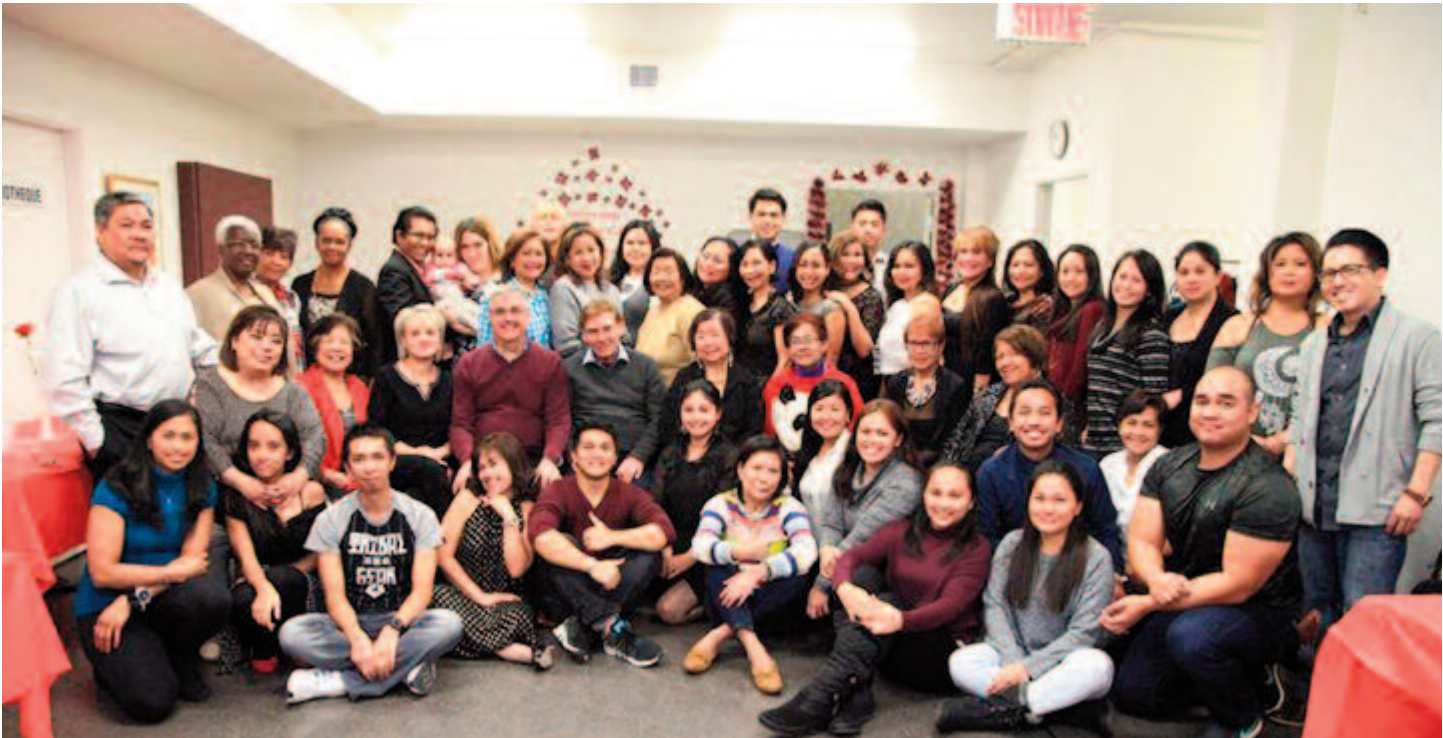
We celebrate Christmas like a family at Gilmore College International. Photo of students, alumni, teachers, former teachers, MMTV crew, and friends. December 3, 2016

“An investment in knowledge pays the best interest.” – Benjamin Franklin