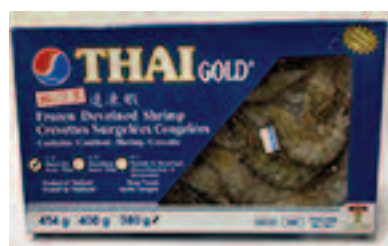
Thai shrimp head on size 30-40 $9.99-box