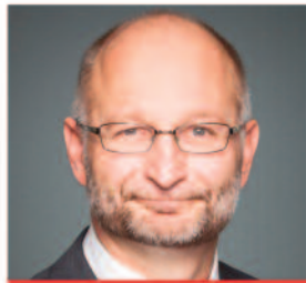
HON. DAVID LAMETTI

MP / Députée Saint-Laurent Emmanuella.Lambropoulos@parl.gc.ca (514) 335-6655