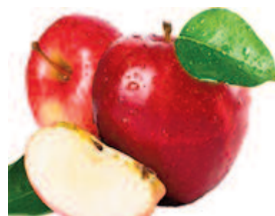
Red apple $0.99-lb