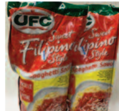
UFC spaghetti sauce 1kg $3.99-ea