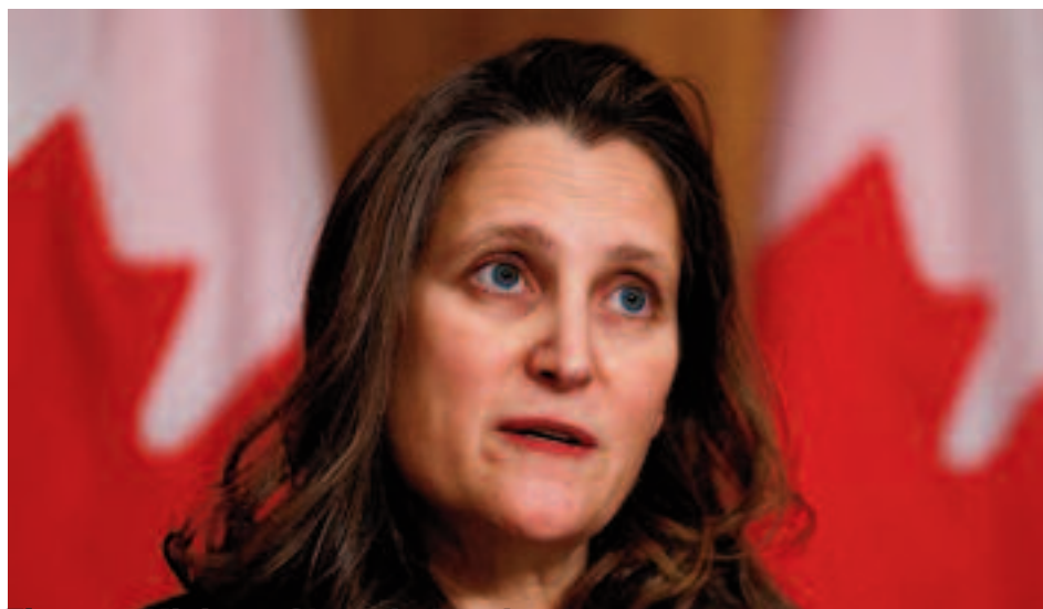
Finance Minister Chrystia Freeland

First, as was announced back in October, the Canada Recovery Hiring Program (CHRP) would be extended until May 7, 2022 and be available for employers with a more than 10 per cent loss in current revenue.