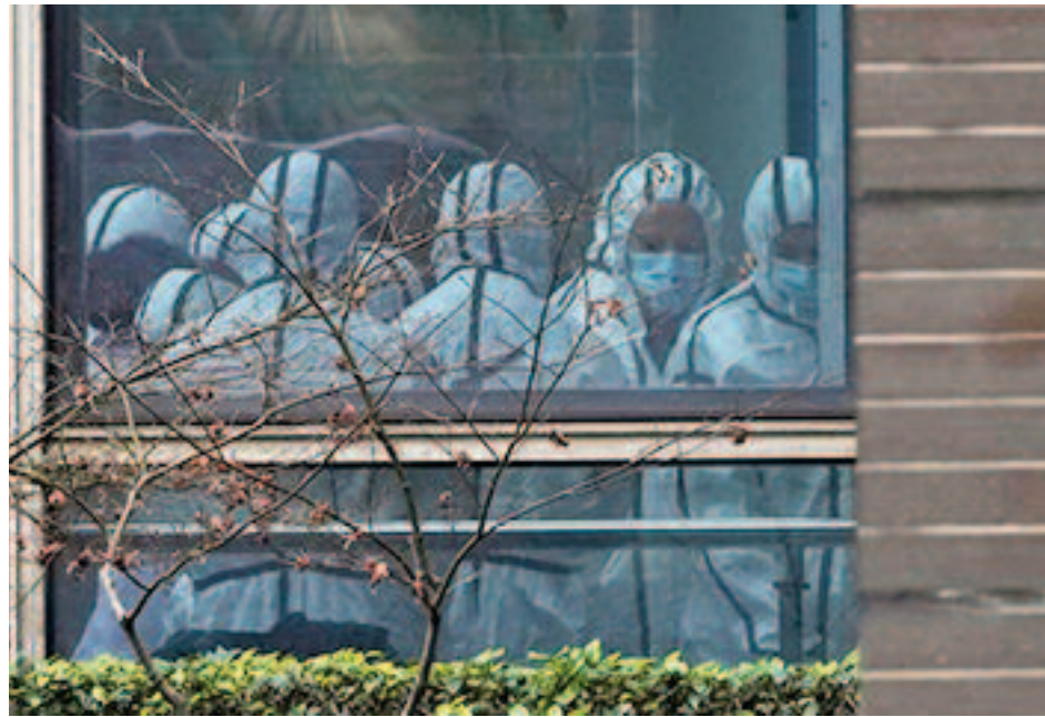
FILE - Members of a World Health Organization team are seen through a window wearing protective gear during a field visit to the Hubei Animal Disease Control and Prevention Center for another day of field visit in Wuhan in central China's Hubei province, on Feb. 2, 2021. Nearly two years into the COVID-19 pandemic, the origin of the virus tormenting the world remains shrouded in mystery.

19 pandemic, the origin of the virus tormenting the world remains shrouded in mystery.