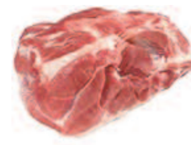
Pork shoulder $2.05-lb