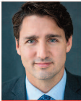
TRÈS HON. JUSTIN TRUDEAU

A MERRY CHRISTMAS AND A HAPPY NEW YEAR 2022!