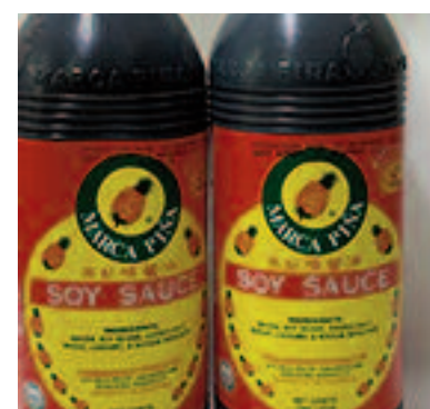
Marca Pina soya sauce 1L $2.49-ea