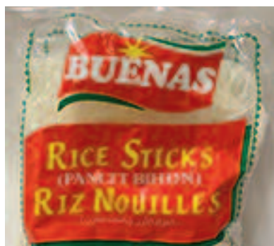
Buenas rice stick 454gr $2.99-ea