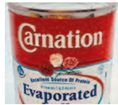
Carnation evaporated milk $1.29-ea