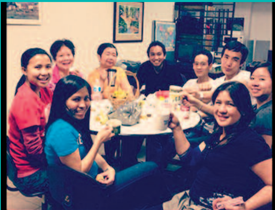
Monday evening French class level 1 (break time)