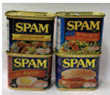
Spam luncheon meat $3.99-can