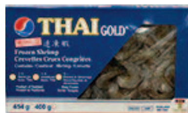
Thai shrimp head less size 61-70 $7.99-box