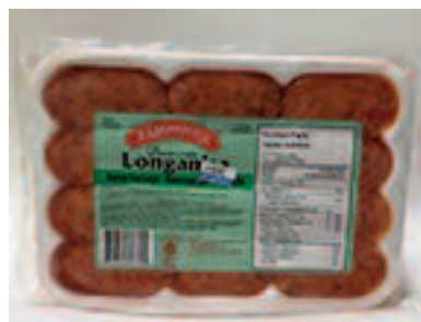
Premium longanisa $2.49-ea