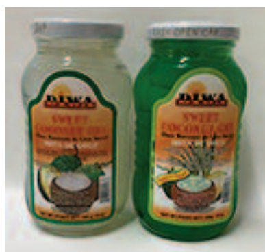
Diwa coconut gel $1.99-ea