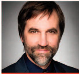
HON. STEVEN GUILBEAULT

MP / Député Notre-Dame-de-Grâce– Westmount Marc.Garneau@parl.gc.ca (514) 283-2013