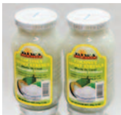
Diwa coconut strings $3.49-ea