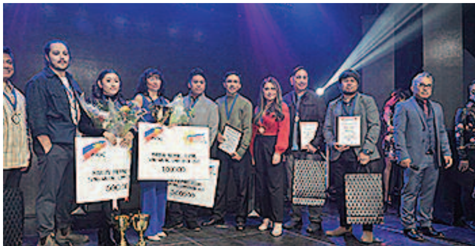
The PIDC-MPF 2021 Songwriting Contest Grand Finalists