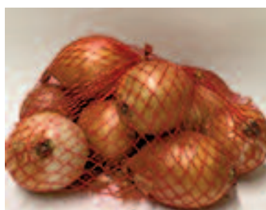
Onion 2lb $0.59-bag