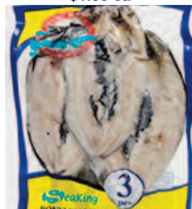
Marinated milk fish $6.99-ea