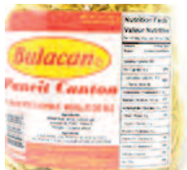
Bulacan pancit canton 454gr $3.49-ea