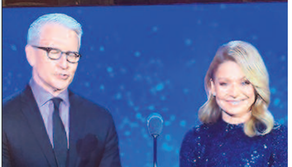
Anderson Cooper and Kelly Ripa hosts of the 2021 CNN Heroes' 15th show held on December 12, 2021