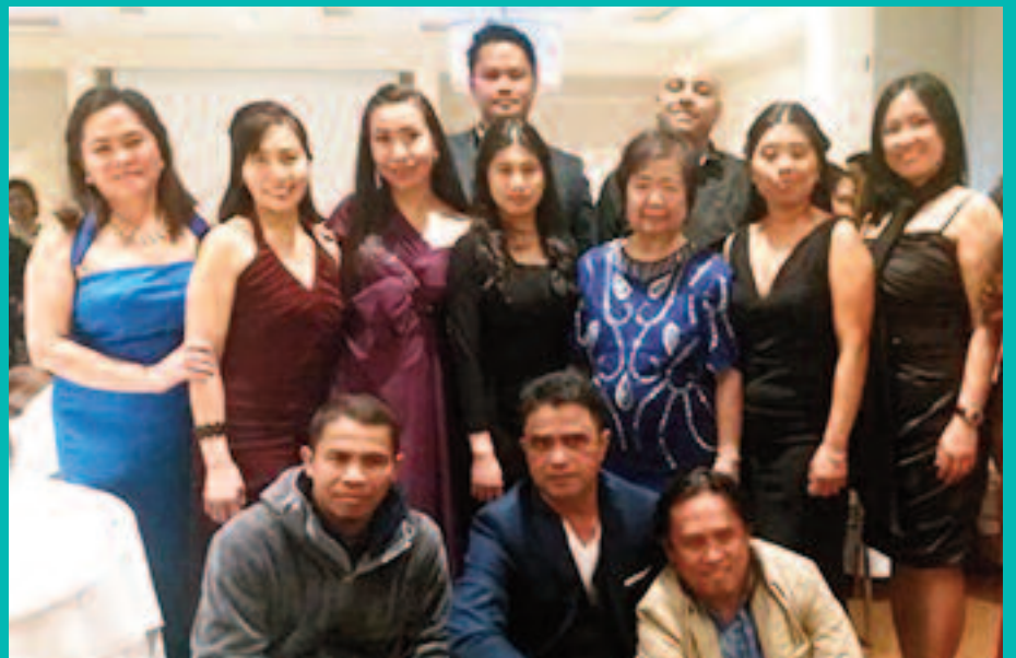
30th Anniversary Souvenir Photo, December 14, 2019 at Hotel Ruby Foo's, Decarie Blvd., Montreal