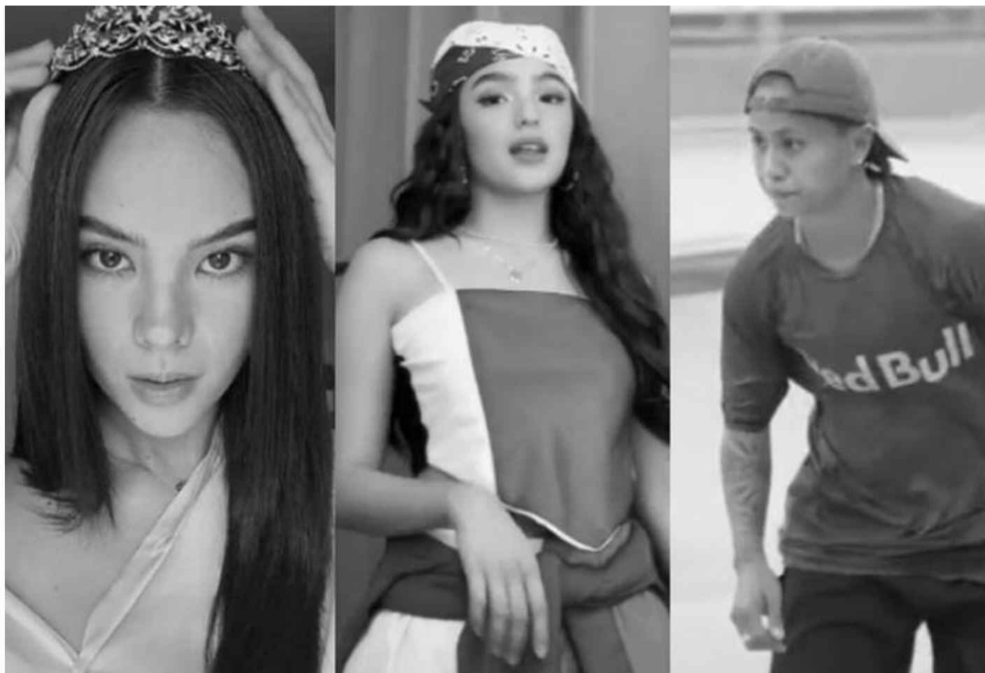
Catriona Gray, Andrea Brillantes and Margielyn Didal

Miss Universe 2018 Catriona Gray was named one of the top stars on TikTok Philippines in 2021, earning recognition alongside fellow local creators Andrea Brillantes and Margielyn Didal.