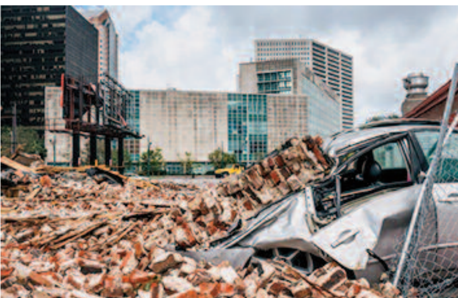
A car is seen under rubble after a building was destroyed by Hurricane Ida on August 30, 2021 in New Orleans, Louisiana.

The world's costliest weather-related disaster this year was Hurricane Ida, a Category 4 storm that cut a path of devastation from Louisiana to New York in late August and early September and caused an estimated $30 billion to $32