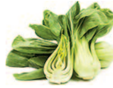
Shanghai bokchoy $0.99-lb