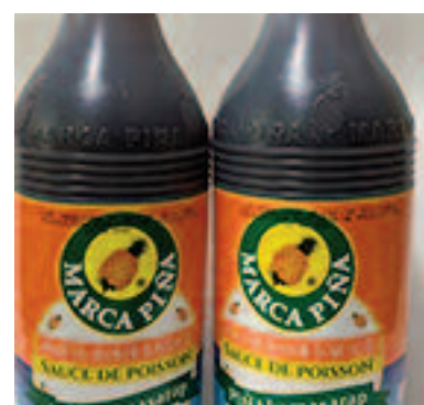
Marca Pina fish sauce 1L $2.49-ea