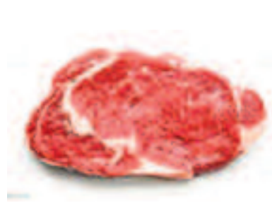
Beef surloin $7.27-lb