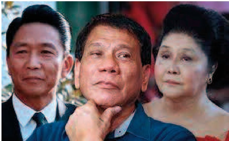
Duterte and the Marcoses

With the three magistrates inhibiting themselves from the case, there will only be 12 justices who can vote on the case, which would require seven votes for approval of the petition. Does Imee have the support of at least seven justices? The fact that majority of the SC justices voted to allow the re-burial of the remains of the late strongman Ferdinand E. Marcos at the Libingan ng mga Bayani (Heroes' Cemetery), indicates the strong influence of President Rodrigo Duterte on the High Court. The interment of Marcos at the Libingan would certainly help Bongbong in his quest for the presidency. Indeed, Duterte had made it known that Bongbong was his preferred successor. But that was before the "Ilocos Six" scandal erupted, pitting Imee Marcos against Rudy Fariñas.