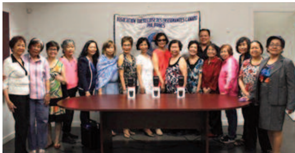
Second group of photography students with the guests during their graduation on May 18, 2017 held at Gilmore College International