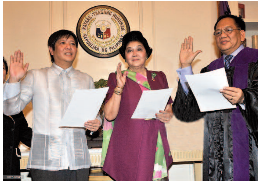
Associate Justice Diosdado Peralta administers the oath of office of former first lady Imelda Marcos and her son Ferdinand "Bongbong" Marcos Jr. as Ilocos Norte 2nd District representative and senator, respectively.

are political protégés of the "Godfather" in Malacañang, President Rodrigo Duterte. They occupy their high positions because the Godfather placed them there to make sure that he has a grip on the HOR. Although nobody would admit to it, they serve at the pleasure of the Godfather. That is the reality of Philippine politics.