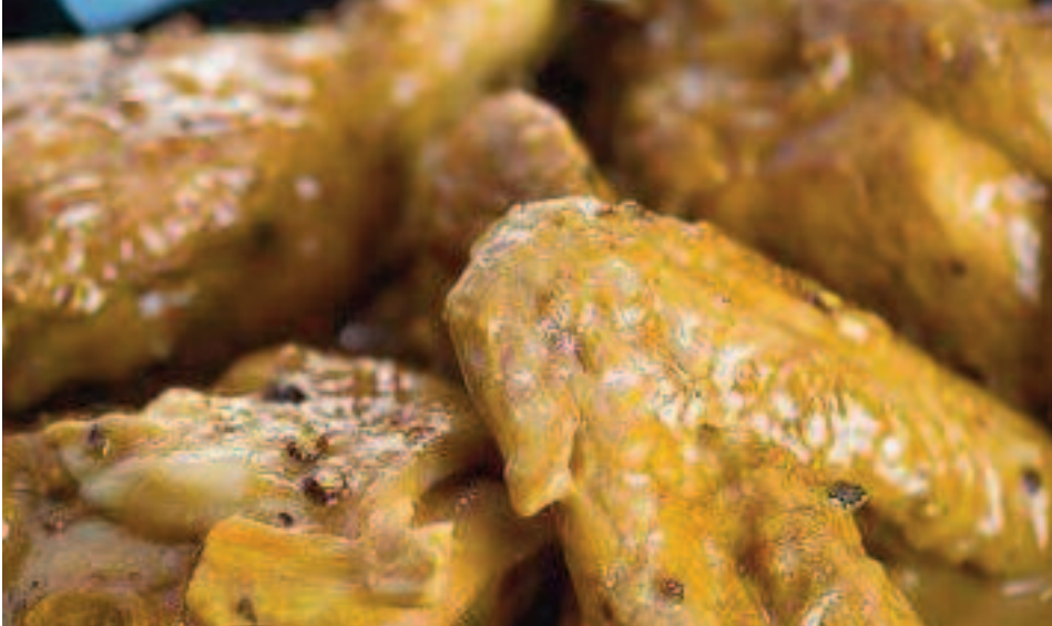
Chicken adobo with coconut milk

Ingredients 2 lbs. chicken, cut into serving pieces 1 head garlic, crushed 1 tablespoon crushed peppercorn 2 cups coconut milk 5 pieces dried bay leaves 6 tablespoons soy sauce 5 tablespoons white vinegar 3 tablespoons cooking oil Instructions Combine chicken, soy sauce, half of the crushed garlic, and crushed peppercorn in a bowl. Mix well. Marinate the chicken for 20 minutes. Heat oil in a cooking pot. Once the oil is hot enough, saute the remaining garlic until it turns light brown. Add the chicken (including all the marinade ingredients) and dried bay leaves. Cook until the chicken browns. Pour vinegar into the pot. Let boil. Stir and continue to cook for 5 minutes. Pour the coconut milk. Let boil. Cover and simmer until the chicken becomes tender. Note: you can continue cooking until the sauce reduces to your desired consistency. Transfer to a serving bowl. Serve.