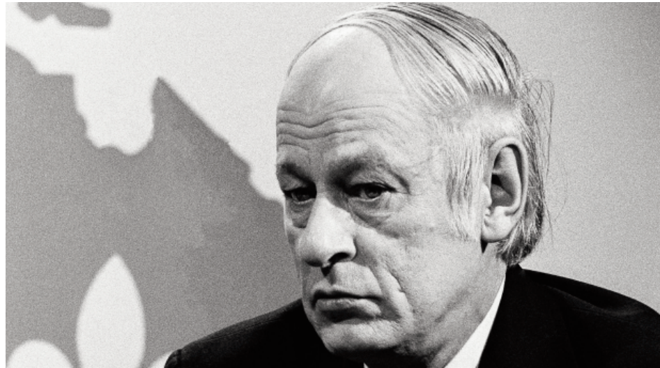
Quebec Premier Rene Levesque attends a meeting in New Orleans, Wednesday, Jan. 10, 1979.

Forty years on, Pauline Marois, PQ premier between 2012 and 2014, calls Bill 101 a partial success.