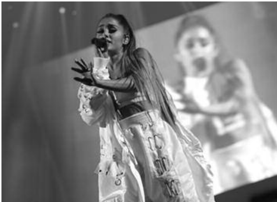
Ariana Grande performing at her Manila concert on Aug 21, 2017

Everyone can sing or spin, but not everyone can sing while spinning, a stunt Ariana Grande effortlessly pulled off even if she was reportedly sick at last night's Manila concert at the Mall of Asia Arena.