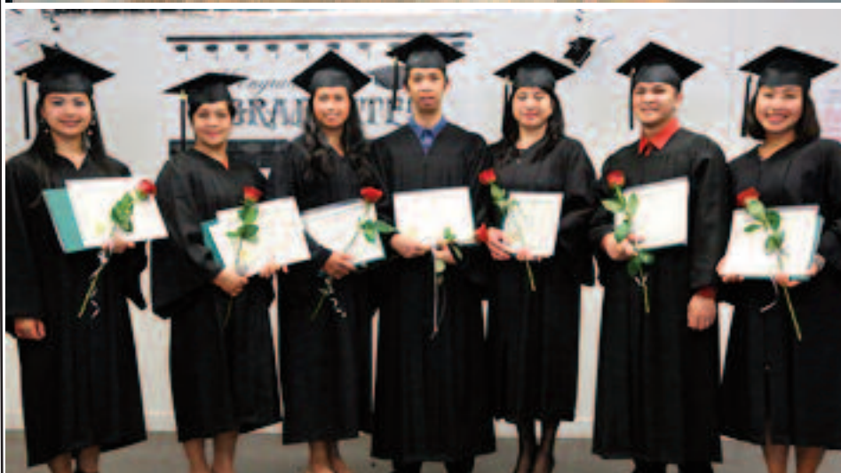
Batch 11 PAB graduates, July 8, 2017.