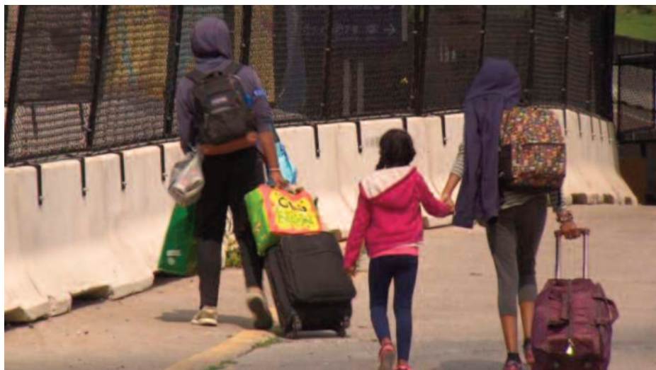
Asylum seekers were allowed to begin enrolling their children into Montreal schools Monday.

Under normal circumstance, once a claim is determined to be eligible, a case must be heard by the IRB within